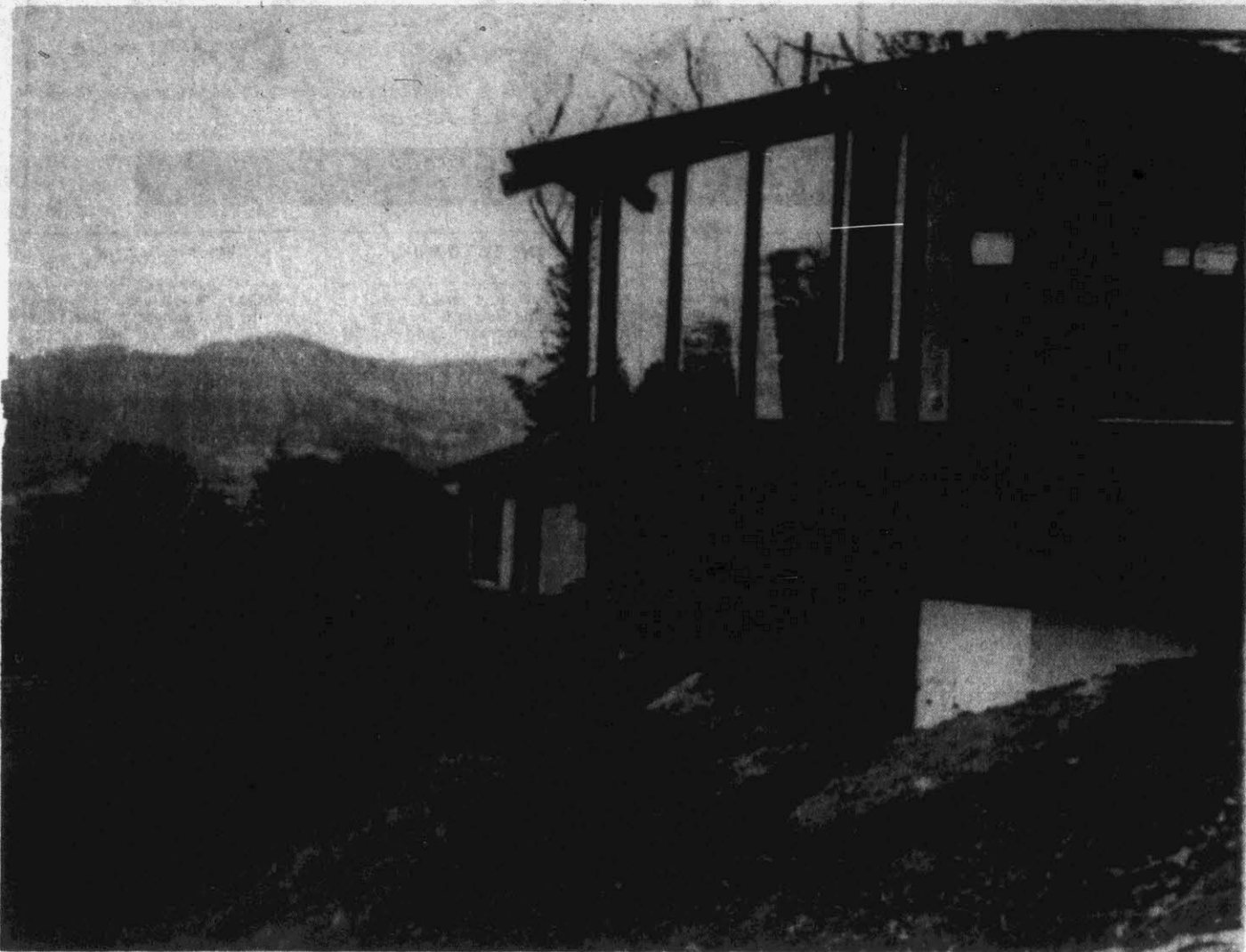
SKI BOOM HOUSING — Slopeside houses such as these, located at the Sugar Mountain resort in North