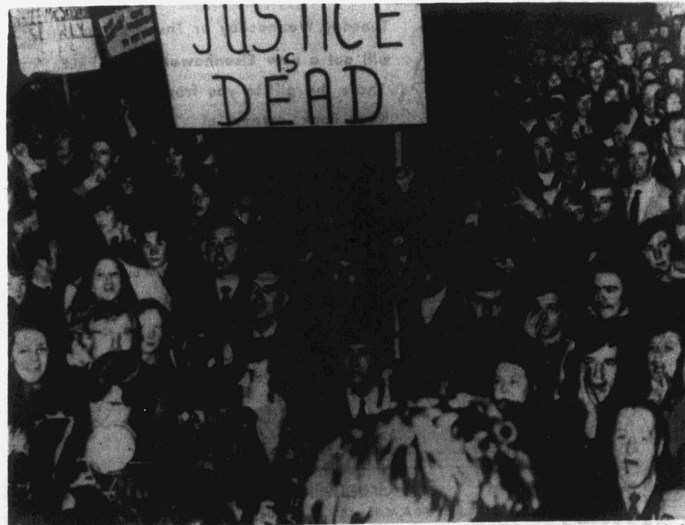
CROWDS PROTEST — Crowds of sympathizers of the Sean Fein, political arm of the Irish Republican Army, march through the streets of Dublin Sunday en route to Mater Hospital, where convicted IRA leader Sean MacStiofain is in police custody. They were

It is too late to correct that mistake, but Mr. Nixon's looming battle over reorganization might still be blunted if he summoned his leaders to Camp David for a personal review of his reorganization schemes. Anything less is an invitation for disaster in the new Congress.