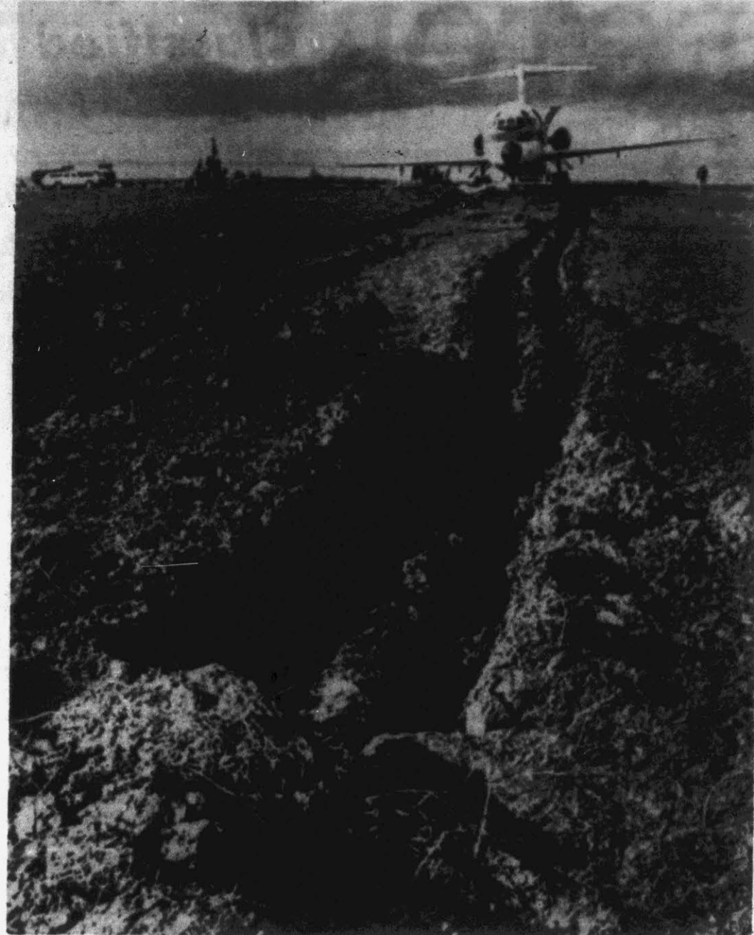
WHERE IT WAS — Tracks in the mud indicate the path of an Eastern Airlines DC-9 took as it ran off the end of a runway while landing Saturday at the Regional Airport near Greensboro during a heavy rain. Photo shows plane being pulled out Sunday. No one was injured in the incident.