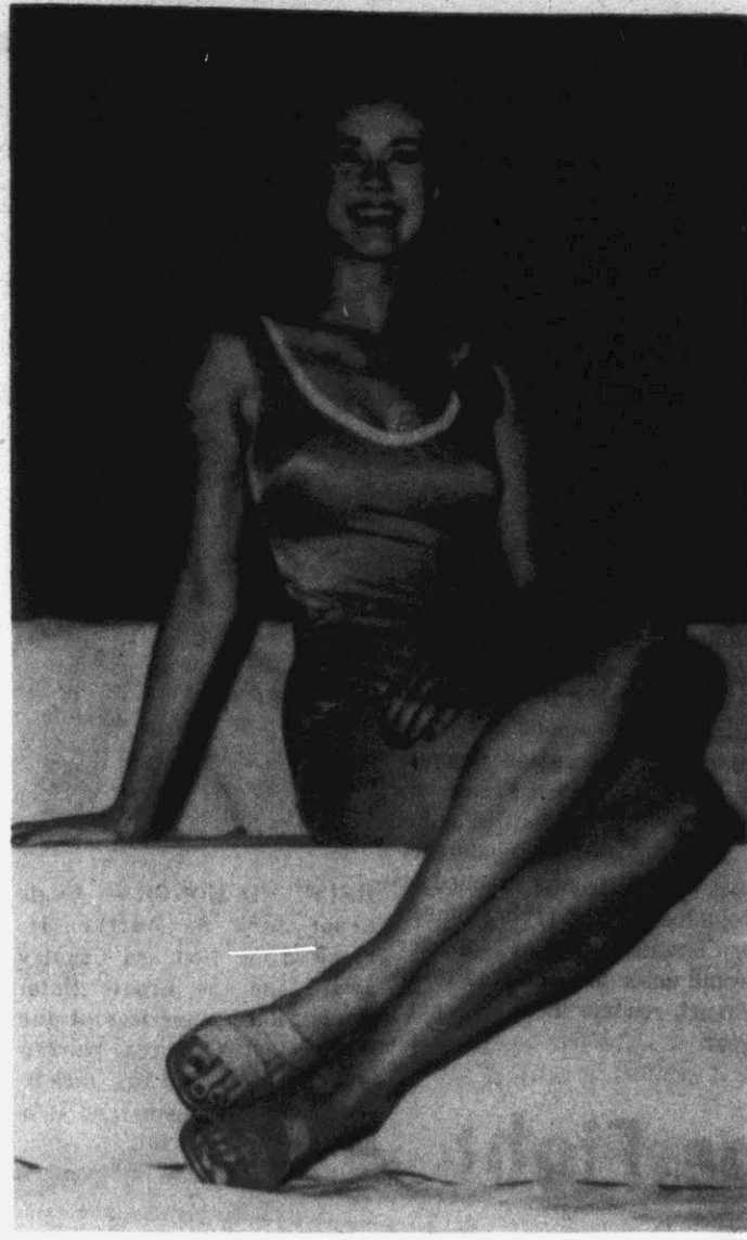
A SMILE FROM MISS U.S.A.—A big smile from 21-year-old Lynda Carter, from Tempe, Arizona, in London Sunday for the Miss World contest.

Eckerd's Drug Store Pitt Plaza Shopping Center