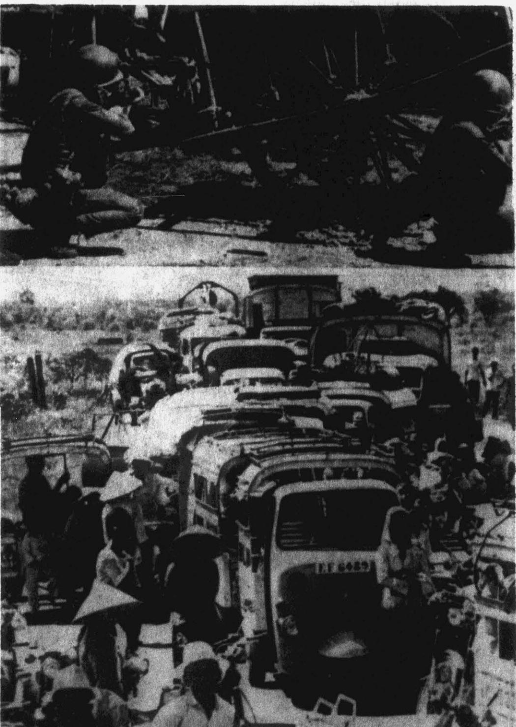
TRAFFIC WAITS — Civilian traffic jams up on the road to the hamlet of Phu Hoa, north of Saigon, while South Vietnamese soldiers, top photo, pour fire into North Vietnamese positions.

INTRODUCTORY OFFER Worth $1.50 Buy one small size B.T. ... get one Free. ECKERD'S DRUG STORE PITT PLAZA