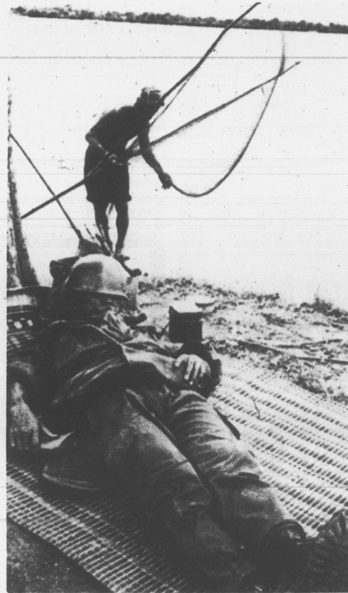
COMBAT RECUPERATION — An exhausted Cambodian Army soldier snoozes near Prek Tameak, Cambodia, while a fisherman continues his placid toils in the background, pulling his nets from the Mekong River. The soldier's unit had been hit hard by Viet Cong mortar fire the previous night at their camp, about nine miles northeast of Phnom Penh.

In a letter to all Highland authorities, the Gaelic Society of London deplored the rapid death of the Gaelic language, spoken by less than 100,000 of Scotland's 5 million population, mainly in the Western Hebrides.