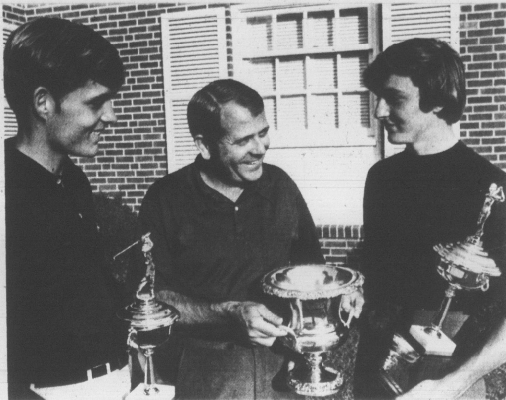
Moyer Golf Winners