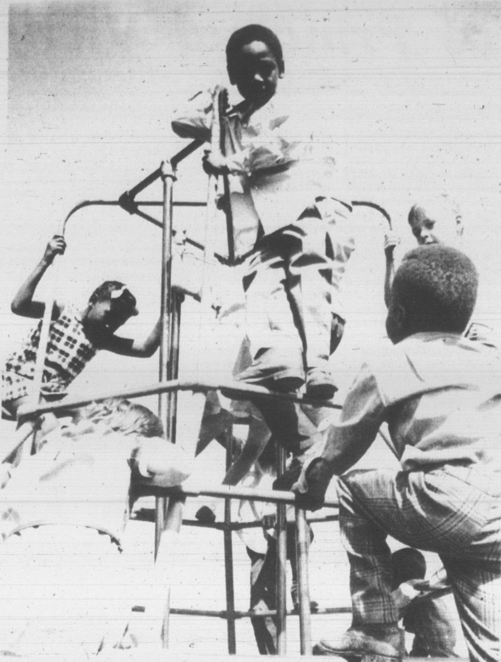
ACTING UP . . . These first graders seem to be enjoying their first day at school as they play on acting bars at Pactolus Elementary School during a play period this morning. About 11,400 Pitt County students began classes for another year as the 22 county schools opened today.

Ladies Delight Chapter No. 10, Order of Eastern Star, will have a call meeting Monday at 8:45 p.m. in the recreation department of the Masonic Temple. Pictures will be taken for the Masonic Scrapbook. G. Frizzell, Worthy Patron