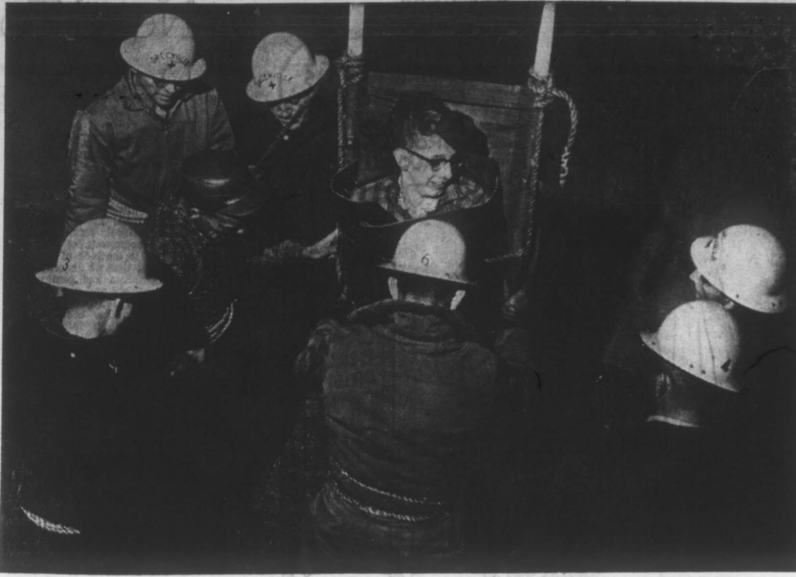
RESCUE PRACTICE . . . Members of the Greenville Fire Department's rescue Unit are shown at a practice session last night as they "brush up" on methods and procedures, before they travel to Roanoke, Va. next week to compete for International honors at the 14th Annual Conference of the International Rescue and First Aid Association. Both the rescue squad's First Aid and Rescue teams, which took State honors here two weeks ago, will take part in the contests.