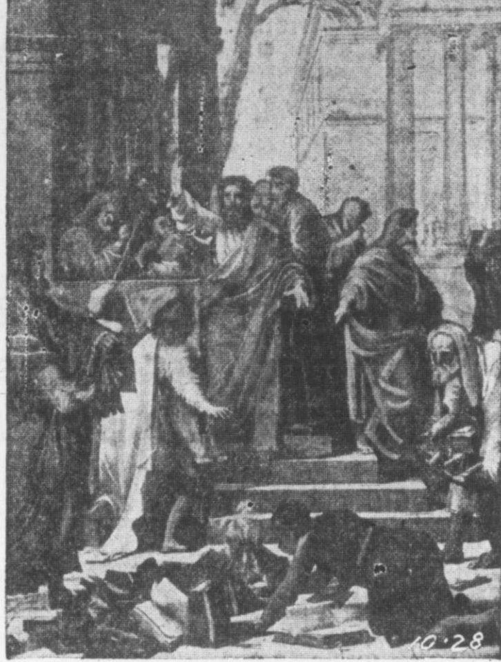
St. Paul Preaching at Ephesus "All the body fitly framed and knit together... maketh the increase of the body unto the building up of itself in love."—Ephesians 4:16.