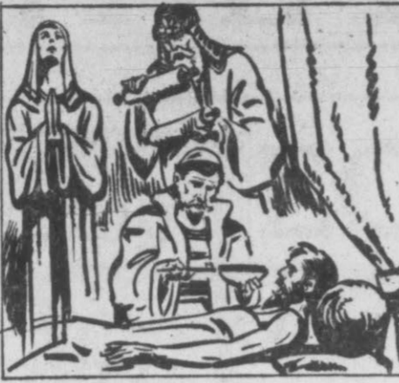
These gifts are different for different people. One may have knowledge, another wisdom, another faith, another gift of healing, another prophecy, another teaching abilities, etc.—I Corinthians 12:8-10, 28-30.