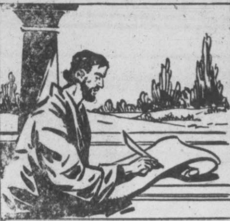
Paul writes from Ephesus to the members of the Christian church at Corinth, telling them that every Christian "is given the manifestation of the Spirit"—some talent—"for the common good."—I Corinthians 12:7.