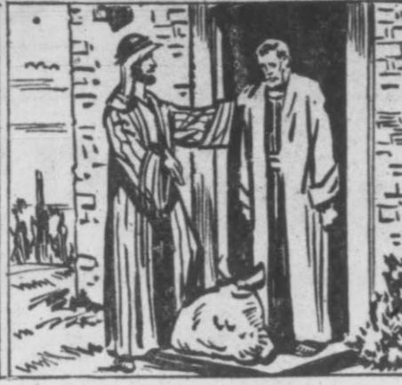
Just as no man can live by himself, so the whole body of Christ—the church—cannot thrive without the best gifts of all its members. It is our duty to look to our neighbors.—I Corinthians 12:12-21.