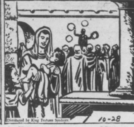
As the human body has vital, but unseen parts, so it is that often the most treasured Christians are not obviously gifted, but have modest talents.—I Corinthians 12:22-25. GOLDEN TEXT: Ephesians 4:16.