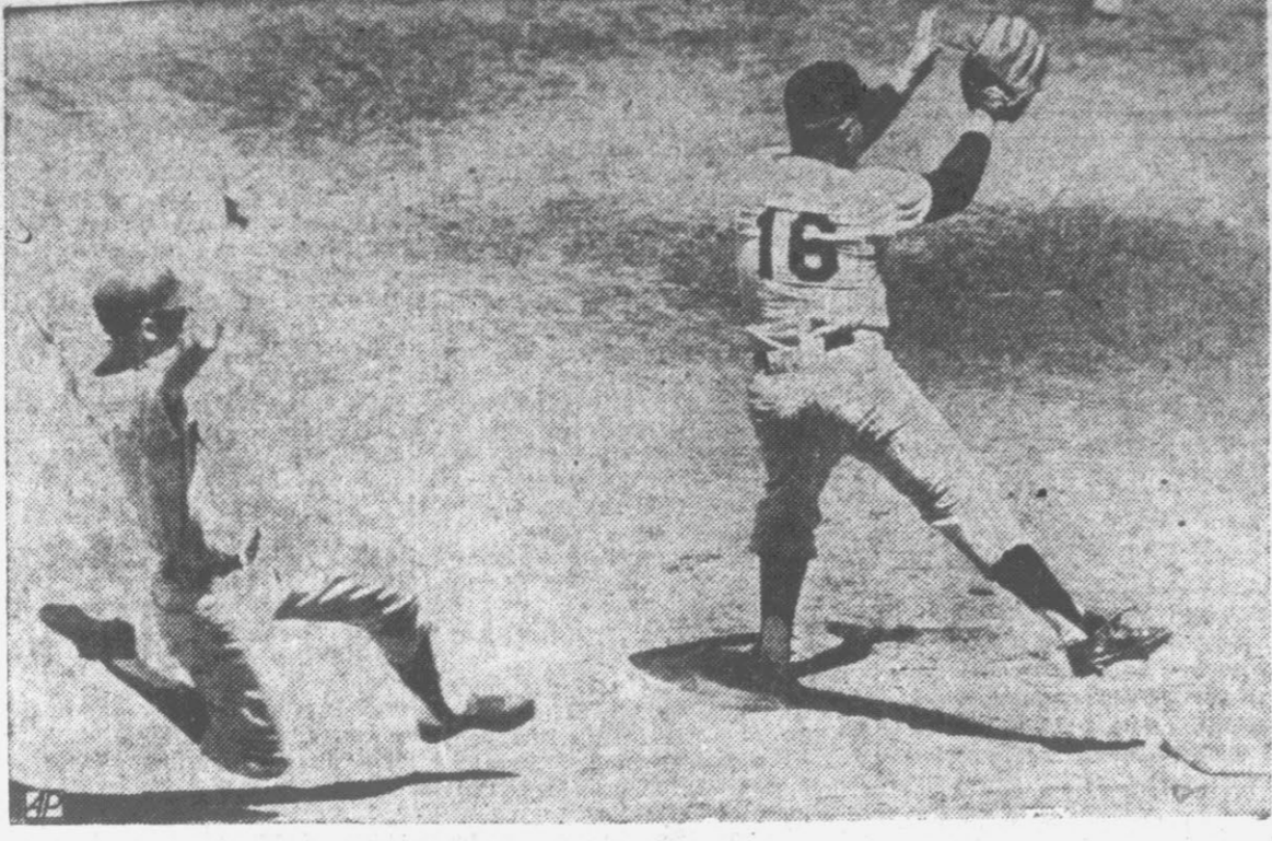
Detroit Tiger outfielder Al Kaline slides into first base to beat out an infield hit in first inning of opener of twin bill at Yankee Stadium. Yankee pitcher Whitey Ford covers first to take the throw from first baseman Bill Skowron who fielded Kaline's hit. Yanks won opener, 6-2, behind the five-hit hurling of Ford who notched his 15th victory of the season.

SEDALIA, Mo. (AP) — Opposing pitchers in a Little League baseball game here Thursday night each pitched a no-hitter.