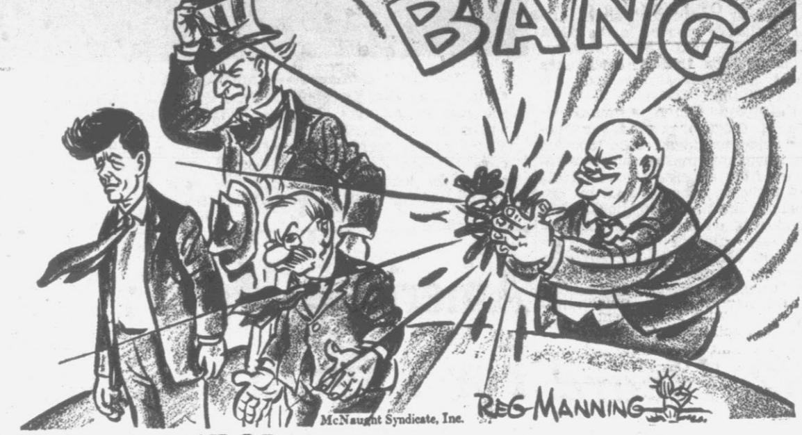
By ALVIN TAYLOR