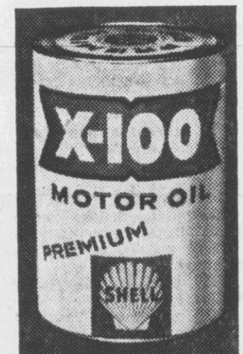
New Shell X-100 Premium.

Trouble #2—crankcase dirt All engines accumulate crankcase dirt no matter how well they are protected by filters. The problem is to stop this dirt from getting together and forming sticky sludge which can clog your engine. Most premium oils use a detergent additive to do the job. And they perform well. But, like other additives, most detergents are metallic and cause that old devil—ash. Shell's solution is to replace detergent with a remarkable new ingredient known as a dispersant, called Alkaldine. The Alkaldine in new Shell X-100 Premium helps keep your engine clean by holding dirt particles apart. Thus they don't form sticky sludge. Some particles can be trapped by the oil filter; most are drained out when you change your oil.