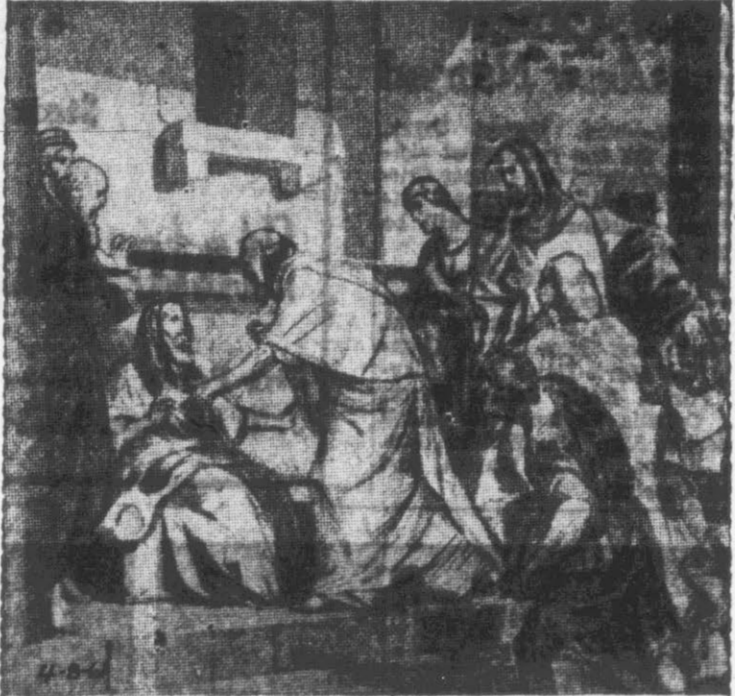
Job receiving the presents of his friends after his restoration to prosperity. "If any of you lack wisdom, let him ask of God, That giveth to all men liberally, and upbraideth not; and it shall be given him."—James 1:5.

11:00 a.m.—Morning Worship Holy Communion each 3rd Sunday 6:15 p.m.—League 7:30 p.m. Wed.—Prayer Service 8:00 p.m. Wed.—Choir Rehearsal