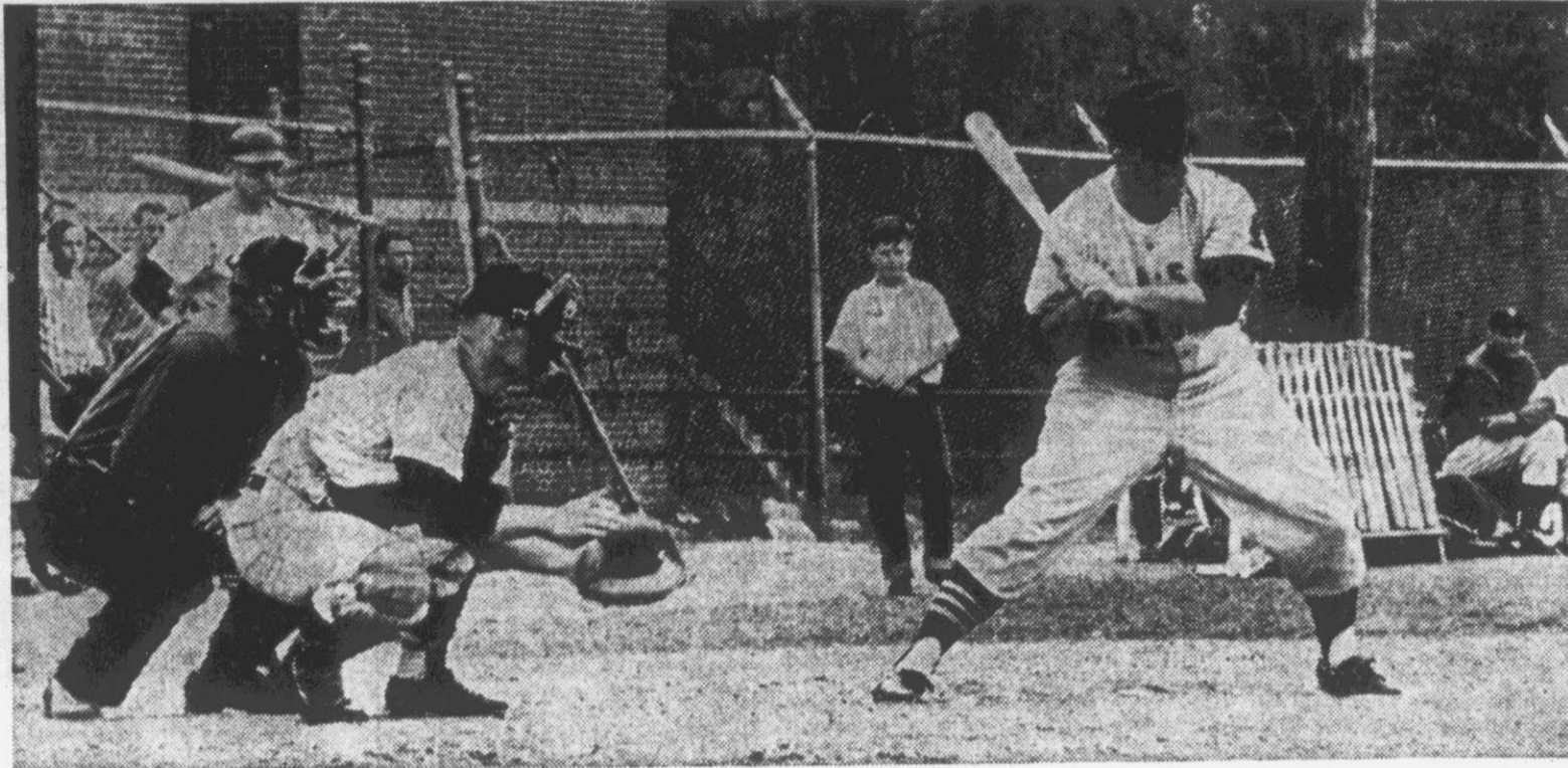
BATTER UP!.. East Carolina College's Pirates walloped the University of Delaware yesterday by a score of 20-0.