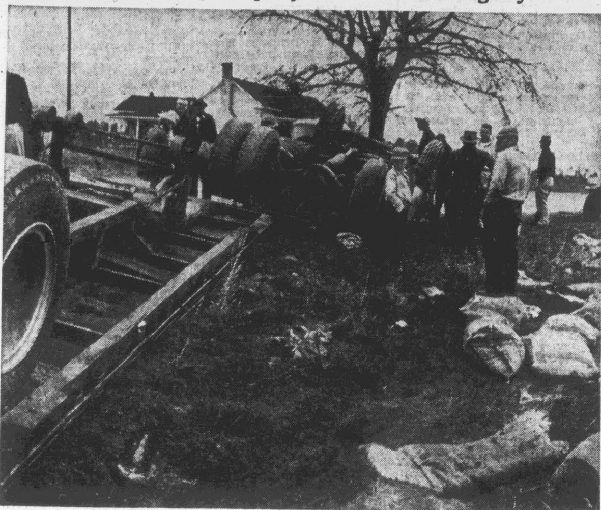
CAR AND TRUCK, both total losses, in wreck near Pitt County line.