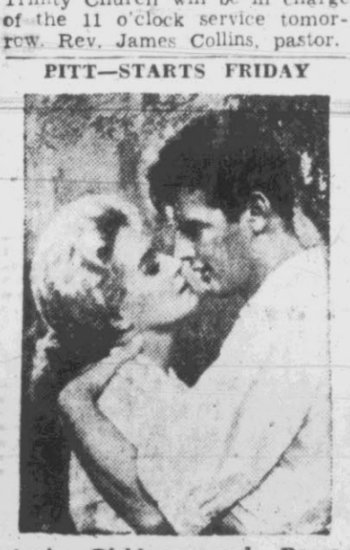
Angle Dickinson and Roger Moore star as a medical missionary and an American volunteer who fall in love in the scene in this scene from Warner Bros. Technicolor production of "The Sins of Rachel Cade."