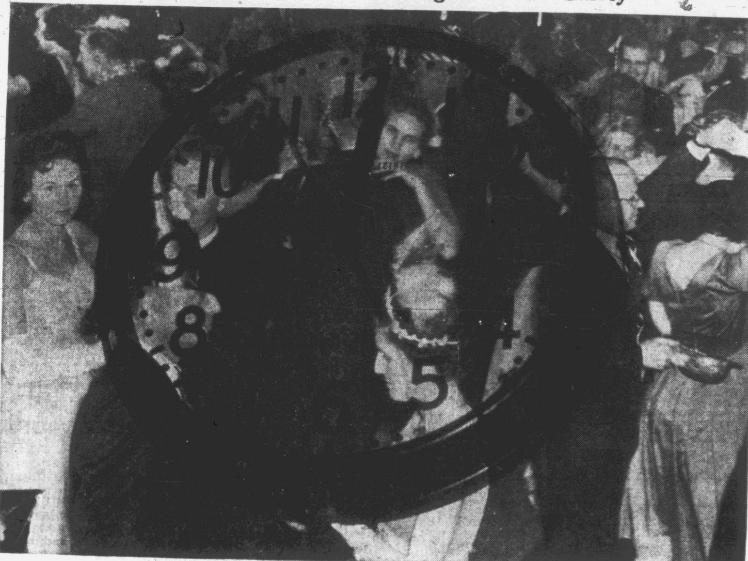
DANCED THE NEW YEAR IN—An estimated 380 people were on hand Saturday night for the Greenville Moose Lodge New Year's Eve party, and greeted 1961 with the customary "count-down". At 1:00 a.m. the lodge served breakfast for the party-goers.