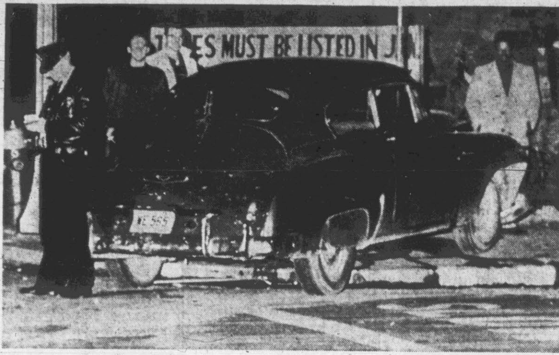
NEW YEARS EVE TRAFFIC ACCIDENT... this car ran on sidewalk at Evans and Third St. late Saturday afternoon.