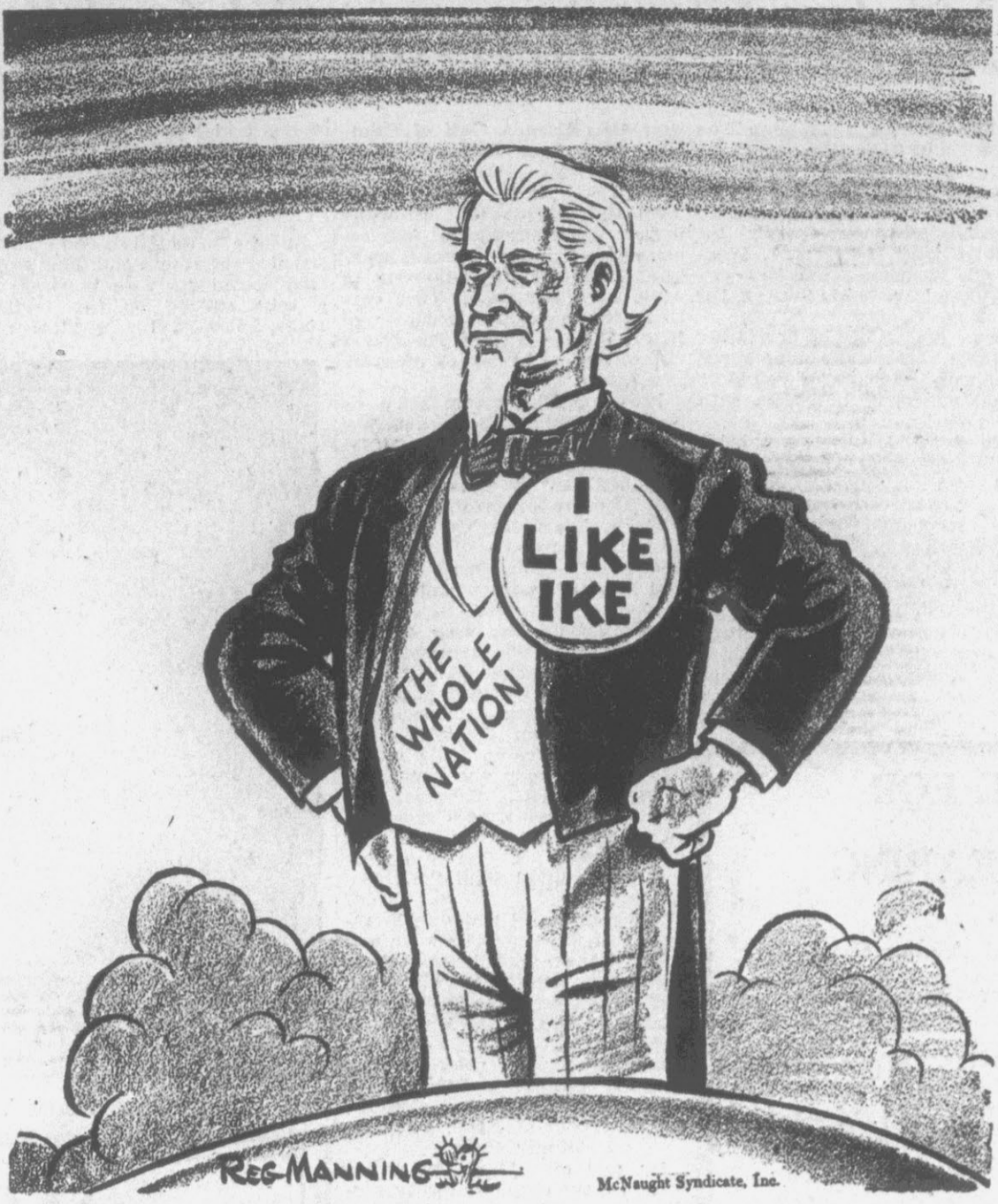
By GEORGE SOKOLSKY