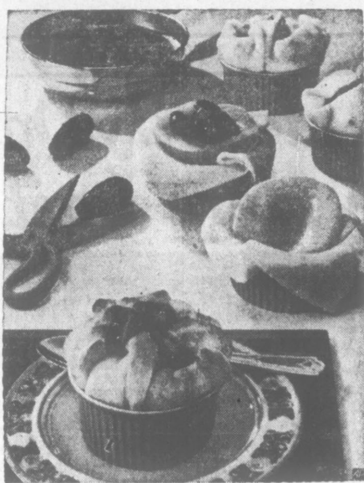
DUMPLINGS COME all sorts of wonderful ways. Here cling peach halves and fresh dates are wrapped in pastry that's rich and flaky to eat.

By CECILY BROWNSTONE AP Newsfeatures Food Editor Take heart, you cooks who have trouble making delicious light and flaky pastry. Take it easy, too. If your peach pies leave something to be desired, try your hand at peach dumplings. You won't have the problem of shaping and fitting a large crust just so, or easing the pie dough into the pan so it won't shrink woefully, or having edges scorch and the top center look pasty.