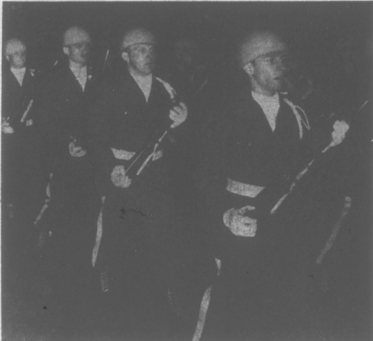
INTO THE NIGHT . . . marathon hike for AFROTC cadets continued at regular cadence — 120 step per minute — for over 12 hours.