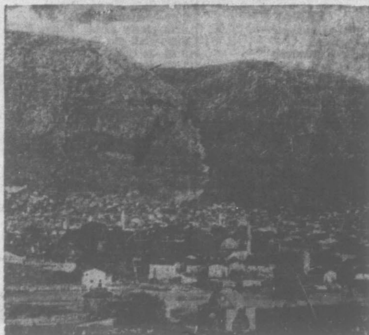
Antioch, general view.

"Man is not justified by the works of the law, but by the faith of Jesus Christ."—Galatians 2:16.