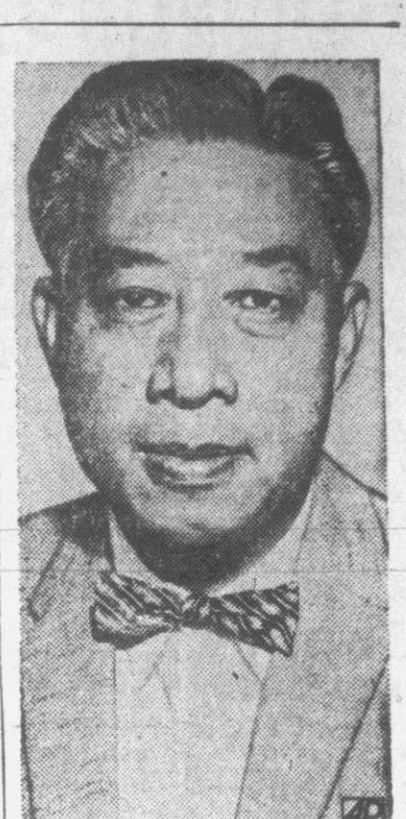
ELECTED — Hiram L. Fong, 52, is the Republican senator-elect from Hawaii.

burglary and an attack on a policeman, was charged with violation of the Sullivan (antiweapons) law after admitting having owned the two guns used in the murders.