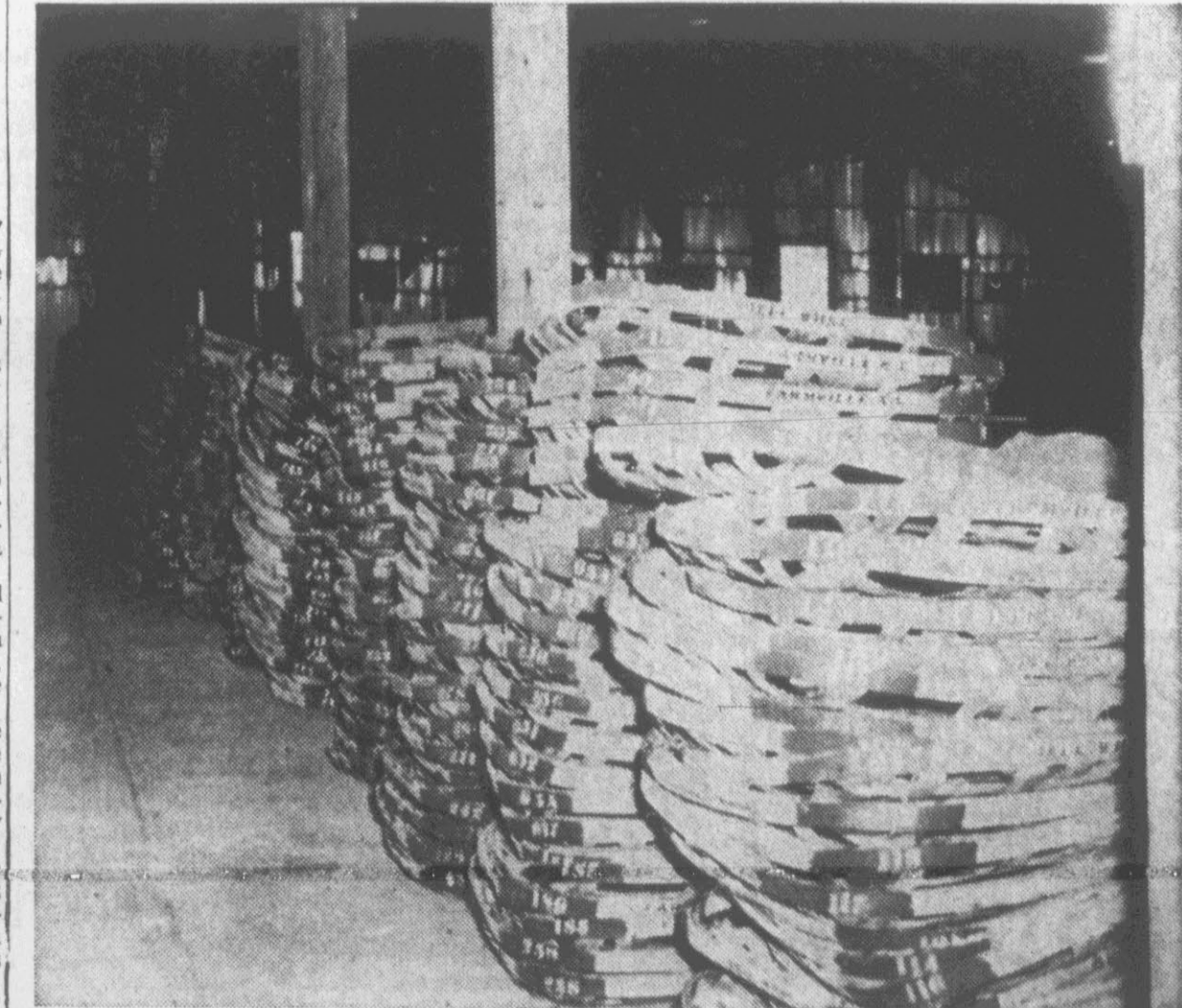
READY AND WAITING—These baskets already cover the warehouse floor at Warehouse in Farmville. All Farmville's tobacco warehouses are preparing for opening day sales when the markets open there for the 1959 tobacco market season next Tuesday morning.