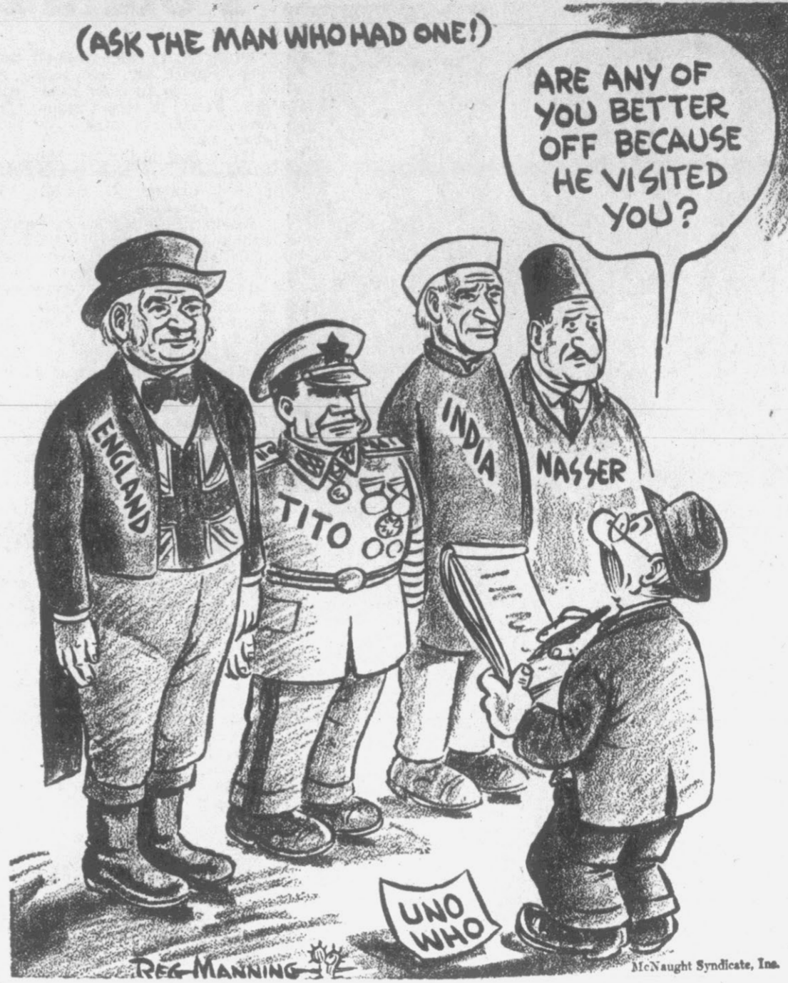
By ALVIN TAYLOR