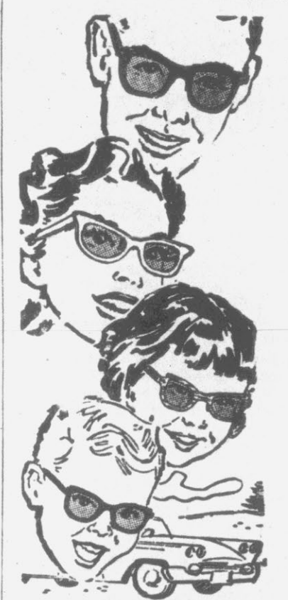
Outdoor Families Need Outdoor Glasses

RALEIGH (AP) — A set of regulations governing North Carolina's new motorboat safety program was adopted Thursday by the State Wildlife Resources Commission.