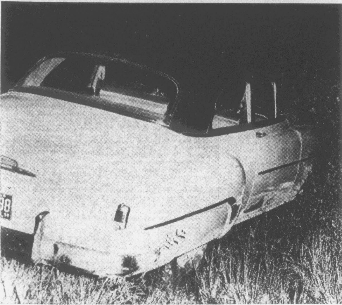
STOLEN CAR . . . operated by a 13-year-old Winterville boy ended up in a ditch on U. S. 264 by-pass near the intersection on N. C. 11 and U. S. 264 South of Greenville after a high-speed chase by a Winterville Police car.