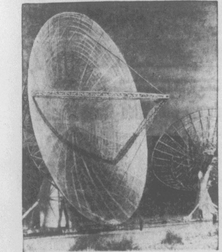
SPACE SCOUTS — These twin giant saucers at Big Pine, Calif., are antennae designed to pick up radio sounds from objects in the far reaches of outer space.