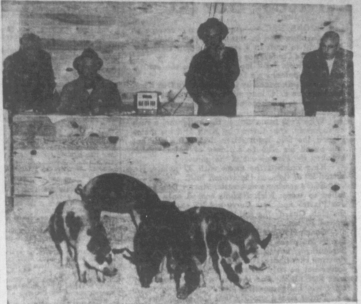
LOT OF PIGS SOLD . . . at yesterday's Pitt County Livestock Development Association feeder pig sale.