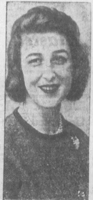
DOUBLE DATE—Princess Alexandra of Kent posed for this birthday portrait in her Kensington Palace home in London. She was 23 on Dec. 25, Christmas Day.