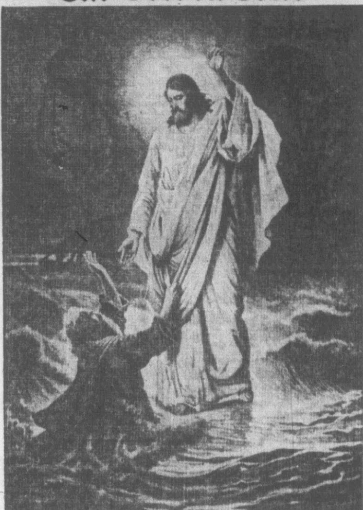
Christ and St. Peter.

"All things are possible to him that believeth."—Mark 9:23.