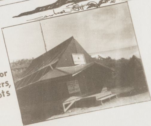
aero club on jungle airbase for passengers, crew, pilots