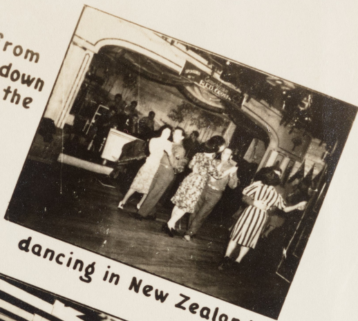
dancing in New Zealand