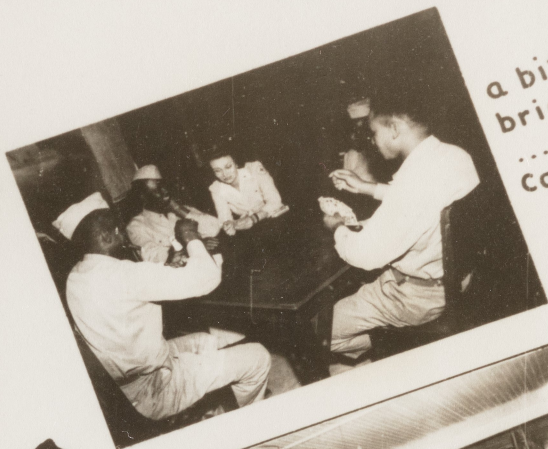
a bit of bridge in ..... New Caledonia