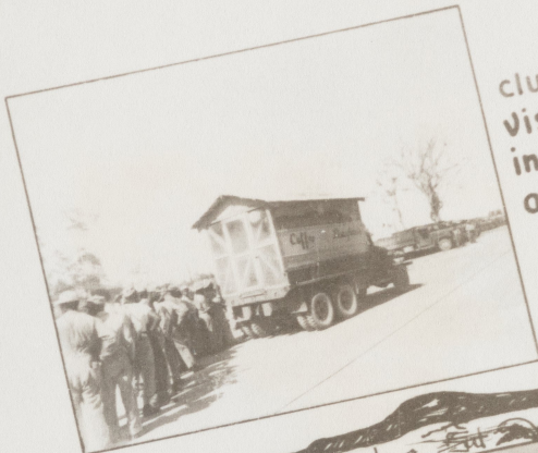
clubmobile visits troops in isolated areas