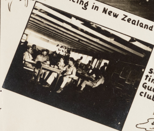
sandwich time in a Guadalcanal club