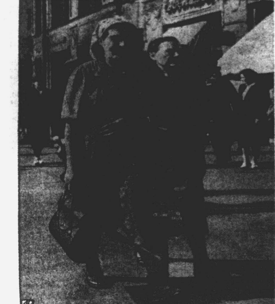
TIRED LOOK: Russian women shoppers stride grimly down a street in Leningrad. Fashionwise, Leningrad is the most Western of the Soviet cities but the shapeless design of Russian fashions is still apparent.

But even so, nothing resembling Ivy League suits and the Paris version of the sack dress prevails in the Soviet fashion world.