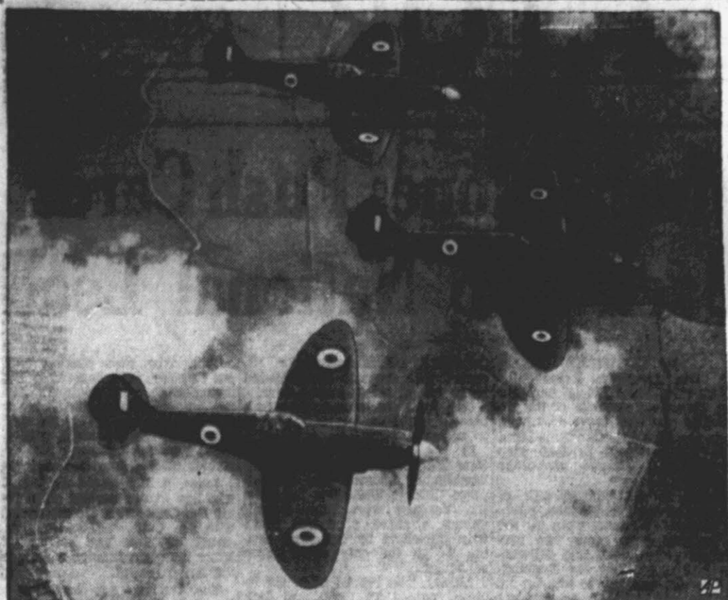
PASS FROM SCENE — The RAF's last three Spitfires, famed for their part in Battle of Britain, fly to Biggin Hill air base where they'll be maintained for ceremonial flights.