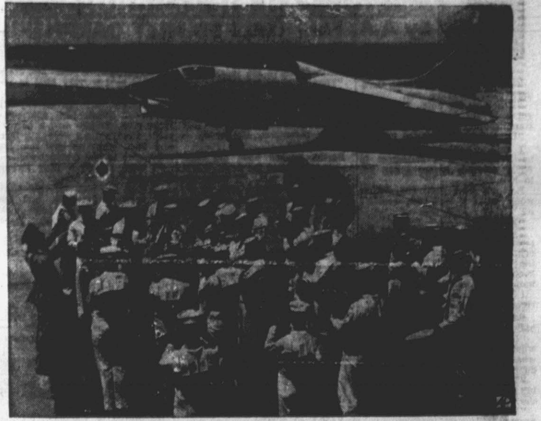
FANFARE FOR THE FEAT —Navy band plays as FSU-1 Crusader jet lands at New York's Floyd Bennett Field to set new transcontinental speed record. Plane, piloted by Marine Maj. John Glenn Jr., flew from West Coast to New York in three hours, 23 minutes, 5.4 seconds.