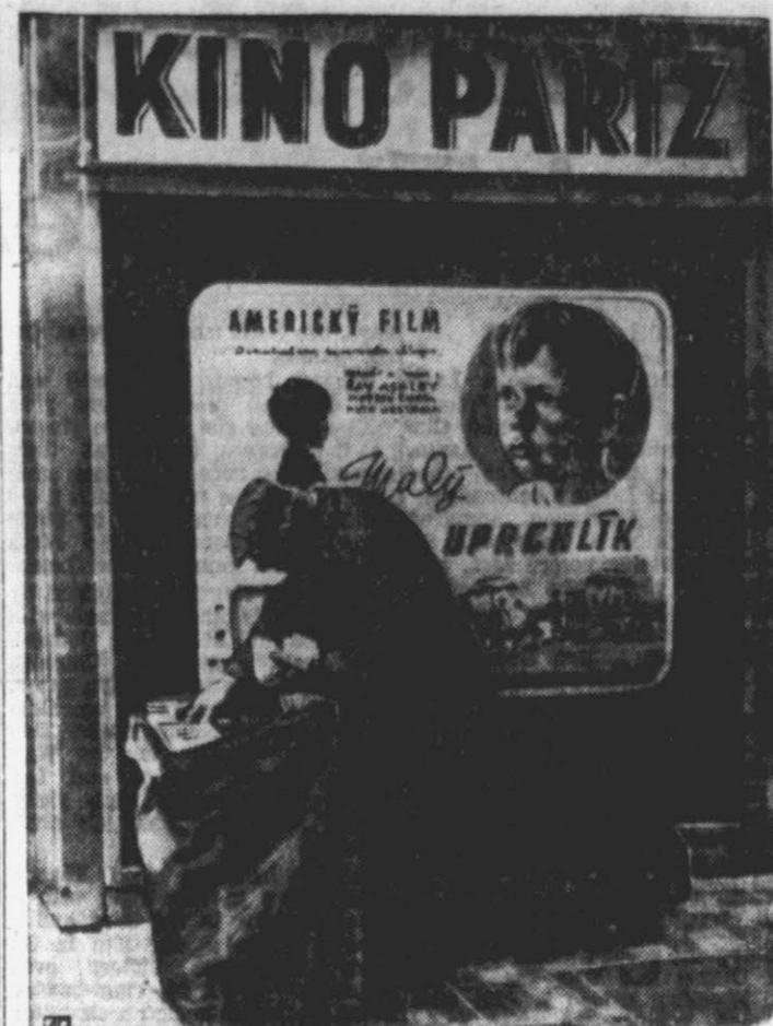
CZECH FIRST—Cigarette salesman partly obscures poster advertising first American film shown at small theater in Prague's Venceslav Square.

By HANNS NEUBERBOURG PRAGUE (AP) — American films have returned to the screens of Communist Czechoslovakia along with a record number of other Western movies. The American movie "The Little Fugitive" has just made its debut in two Prague cinemas. Czech national film import officials said they are hopeful it will be followed by about eight others this year. U. S. productions already approved by the film import commission and now subject to purchase negotiations include "Marty," "Trapeze," "Roman Holiday," "Picnic," "East of Eden" and "20,000 Leagues Under the Sea." Officials here predict Czech fans will soon have a new film idol after the first showing of "Trapeze. Up to now, they haven't known Gina Lollobrigida, bosomy Italian star of the film. "We are not so much interested in bosoms," Dr. Emil Polak, director of the Czech National Film