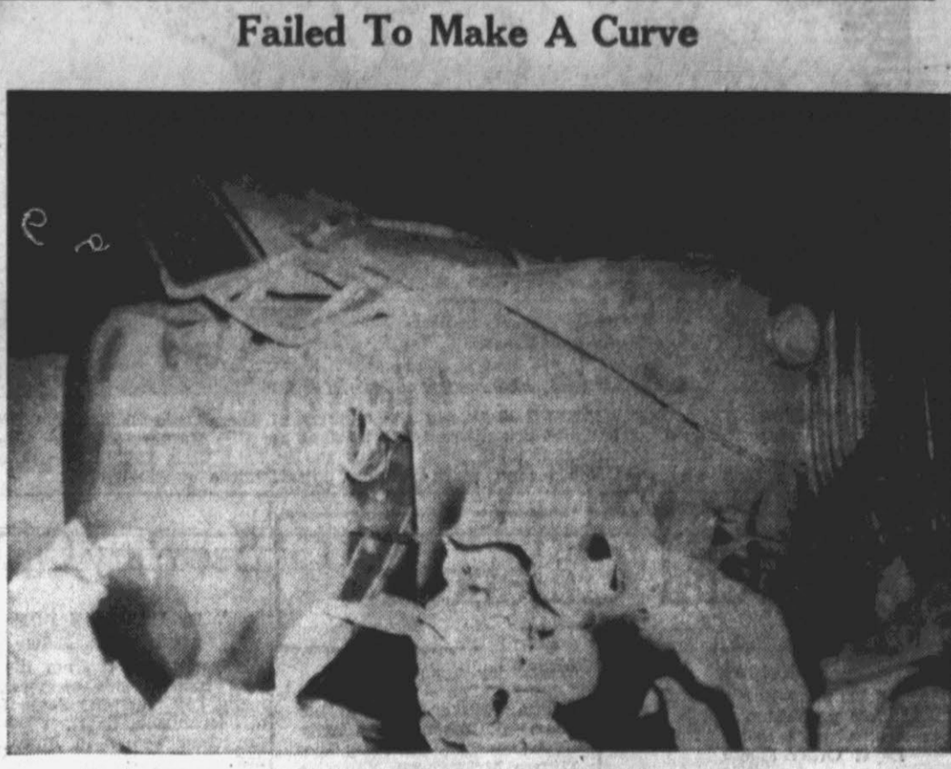
SEVENTH FATALITY . . . youth dies under overturned car.

He may well have committed the murder of Marilyn Sheppard. However, no one should form any final opinion on this man until after there has been a lot more investigative work done and until there has been a psychiatric investigation.