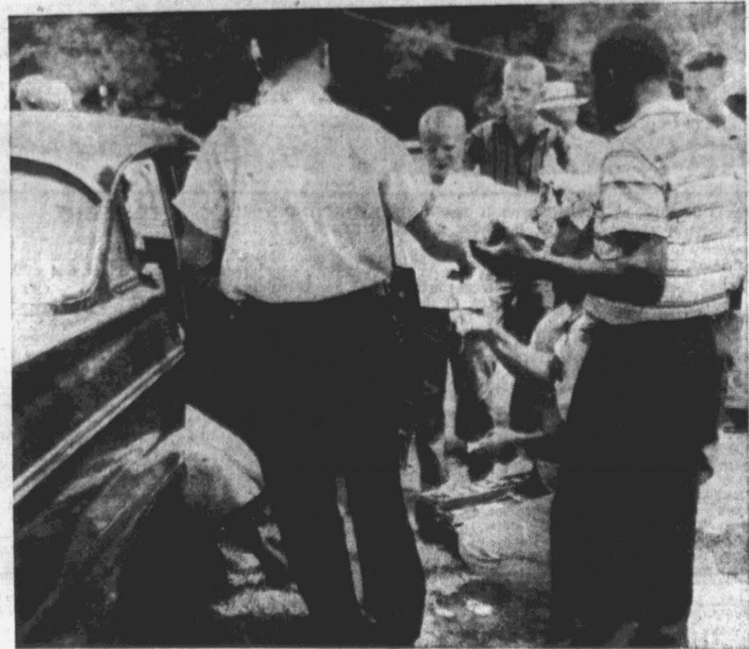
INJURED WOMAN IN SATURDAY WRECK ... Receives treatment from Rescue Squad