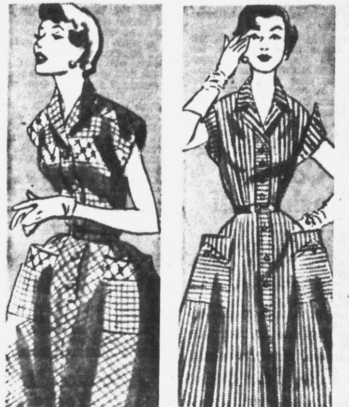
Sanforized gingham check in pink, blue or helio. Sizes 12 to 20, 14½ to 24½. $2.79

MARVEL at the outstanding fashion details—5-yard sweep skirts, costly trimmings, all-around pleats! PAY JUST $2.79 EACH! Whatever style you choose . . . whatever size you wear, from a junior size 9 to an extra size 52!