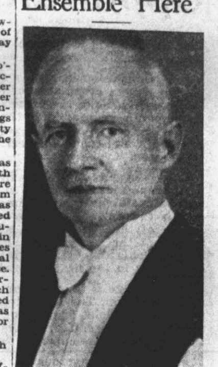
Dr. John Finley Williamson, founder and director of the internationally famous Westminster Choir, will direct the choral ensemble when it appears at East Carolina College tonight, under the auspices of the college Entertainment Committee. The performance will take place at 8 p.m. in the Wright auditorium.

According to a recent nationwide survey, Dr. Williamson was voted one of America's most popular choral directors. First place in the survey resulted in a three-way tie between Dr. Williamson, Fred Waring, and Robert Shaw.