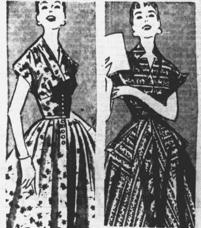
Empire-waisted print with an all-around stitch pleated skirt—a Penney first at our popular Brentwood price! Sizes 12 to 20, 14½ to 24½. No ironing. $2.79