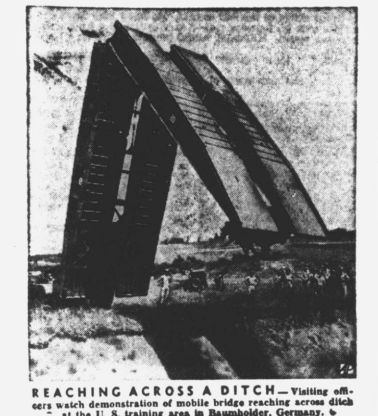
REACHING ACROSS A DITCH.—Visiting officers watch demonstration of mobile bridge reaching across ditch at the U. S. training area in Baumholder, Germany.

3% Current Dividend Rates Assets Over $5,000.00 On Insured Accounts More than 3,500 Americans hold glider flying licenses.