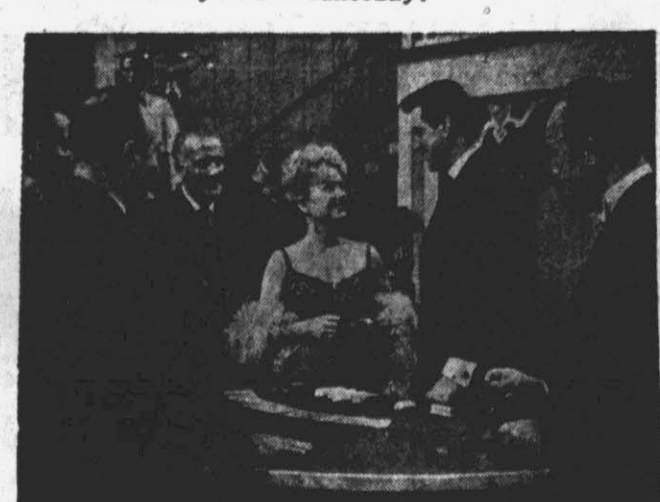
Rock Hudson and Anne Baxter are the co-stars of the dramatic picture, "One Desire."

ers controlled most of the town. In the afternoon they attacked the government building, but the armed civilians beat them off.