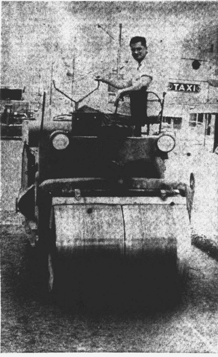
Following the paving machine as it places a coat of asphalt on Dickinson Ave is the roller shown above which packs and smooths the paving material. Work on the street is expected to be completed tomorrow afternoon.