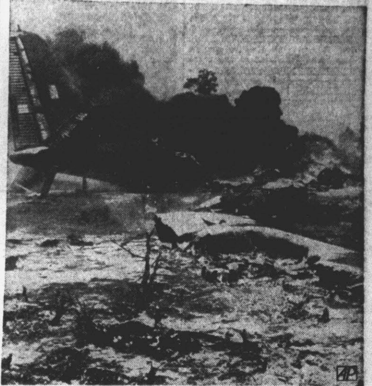
One airman was killed as 10 others parachuted from a KC97 refueling craft on a routine flight from MacDill Air Force Base at Tampa, Fla., before it crashed and burned in a pasture near Englewood, Fla. Here only the tail section can be identified as remains of the plane still smolder. A survivor said one of the four engines broke loose cutting fuel lines to the rest. Three crewmen were hospitalized with injuries described as not serious.