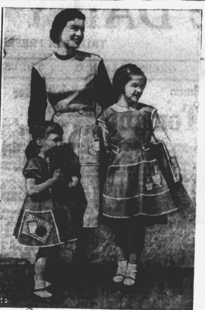
APRON TRIO ... These gay cover-up aprons for the whole family are easy to make at home in bright sturdy denim, with standard patterns. Applique designs individualize each apron. Children's aprons may double as sun dresses, since they are completely closed in back.