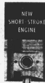
NEW SHORT-STROKE ENGINE

Check the specifications! If the stroke is as short as, or shorter than the bore—it's a short-stroke engine. Reduced piston travel cuts friction. Piston rings last up to 53% longer. Gas savings up to one gallon in seven!