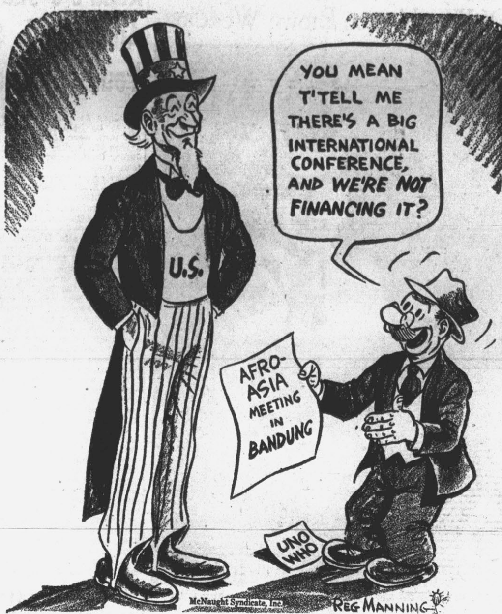
Somebody Told Me