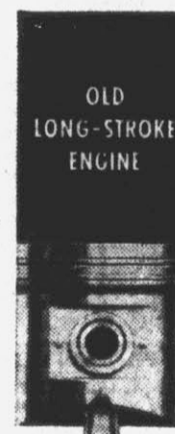
OLD LONG-STROKE ENGINE