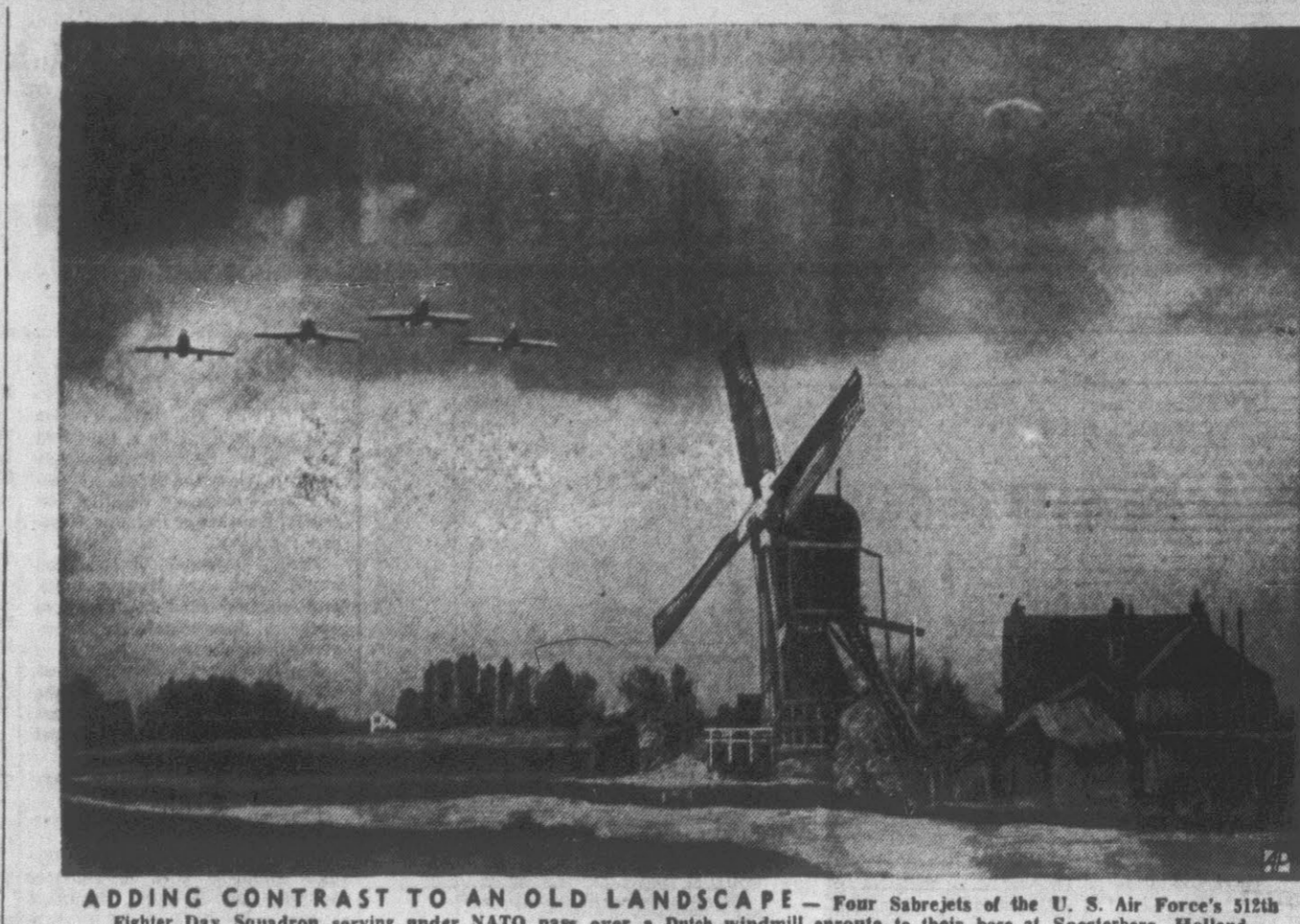
ADDING CONTRAST TO AN OLD LANDSCAPE—Four Sabrejets of the U. S. Air Force's 512th Fighter Day Squadron serving under NATO pass over a Dutch windmill enroute to their base at Soesterberg, Holland.

Gave the jitters to the caged feathered pets of numerous residents of the vicinity.