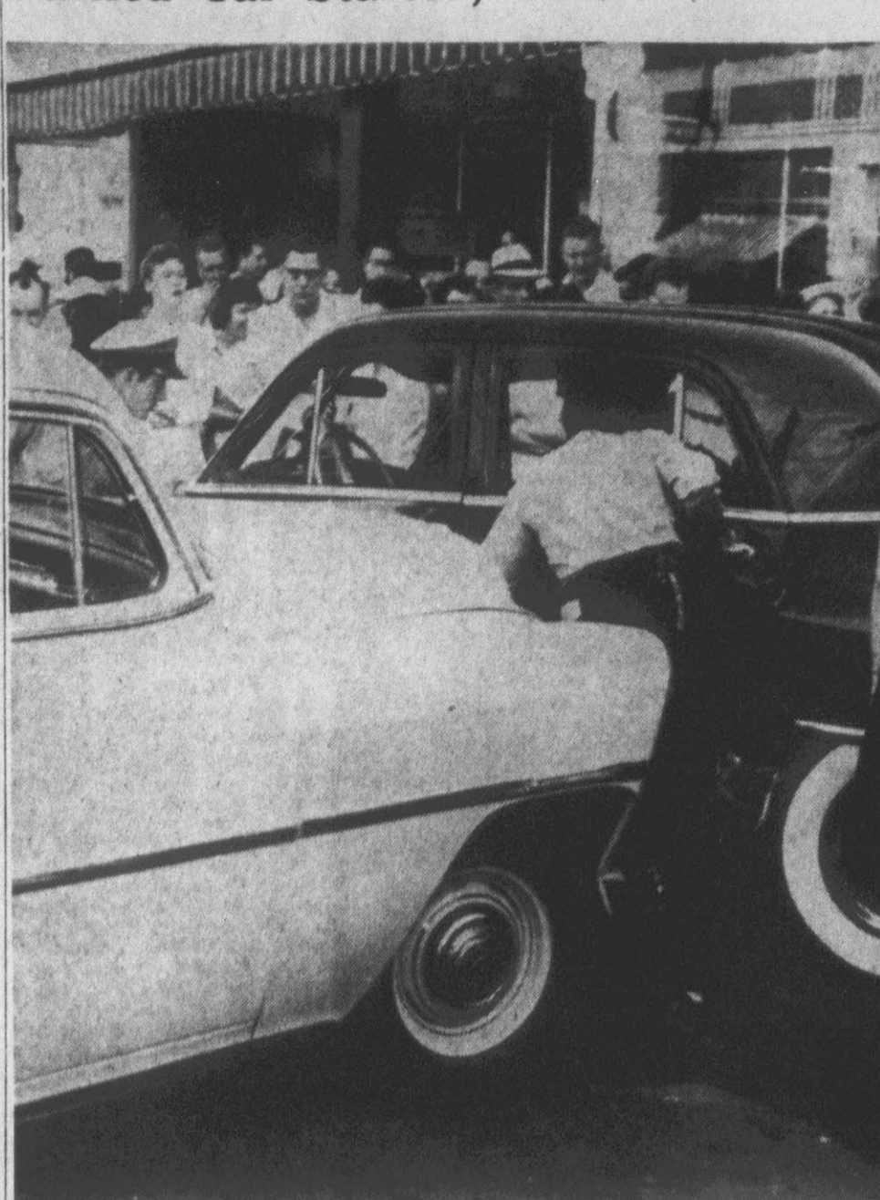
A "freak" accident on Evans Street this morning about 9:55 caused approximately $700 damage to the two automobiles and slightly injured one woman.