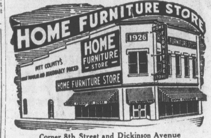
Corner 8th Street and Dickinson Avenue

The Richest Child is Poor Without Music! Back-To-School Time is a very good time to start your child in music. Renting a new Kimball piano is the perfect answer. With modern teaching methods and the easy-touch Kimball, learning is REAL FUN and easy. Soon this new skill will create poise, self-confidence, even better grades. If you wish, next fall you can apply the rent and drayage to the piano's purchase price, the balance in easy payments. See and hear the new Kimball Consolelets; no other piano offers you ALL FOUR "Tone-Touch" features!