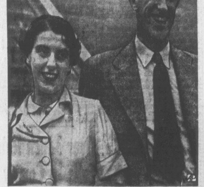
TO TELL OF EVEREST —Mount Everest conqueror Sir Edmund Hillary and his wife arrive in London for a series of lectures on his climb of the world's highest mountain.

WHITNEYVILLE, Me. (UP)—A home-cooked blueberry pie was the "ticket" for admission to the annual Blueberry Ball here.