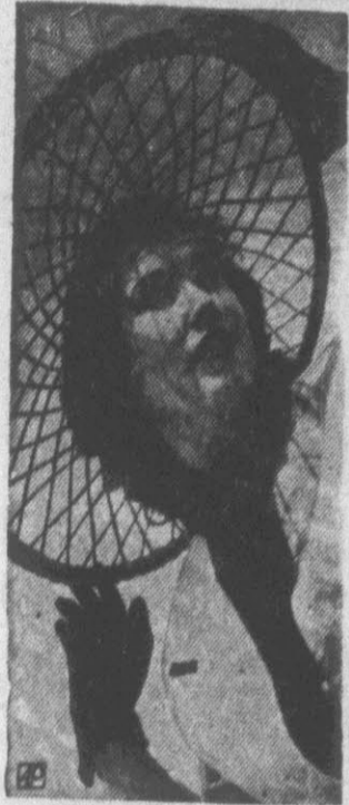
SUNSPOKE HAT —This wheel-shaped straw hat, design of the Vienna Fashion School, comes in all shades. It's attractive, even though it doesn't keep off the hot sun.

AVOIDING DEPRESSION MEICO CITY (UP)—A city traffic department order today prohibited hearses from parking in front of funeral homes. A department spokesman said the ban was invoked "to avoid a depressing sight to the public."