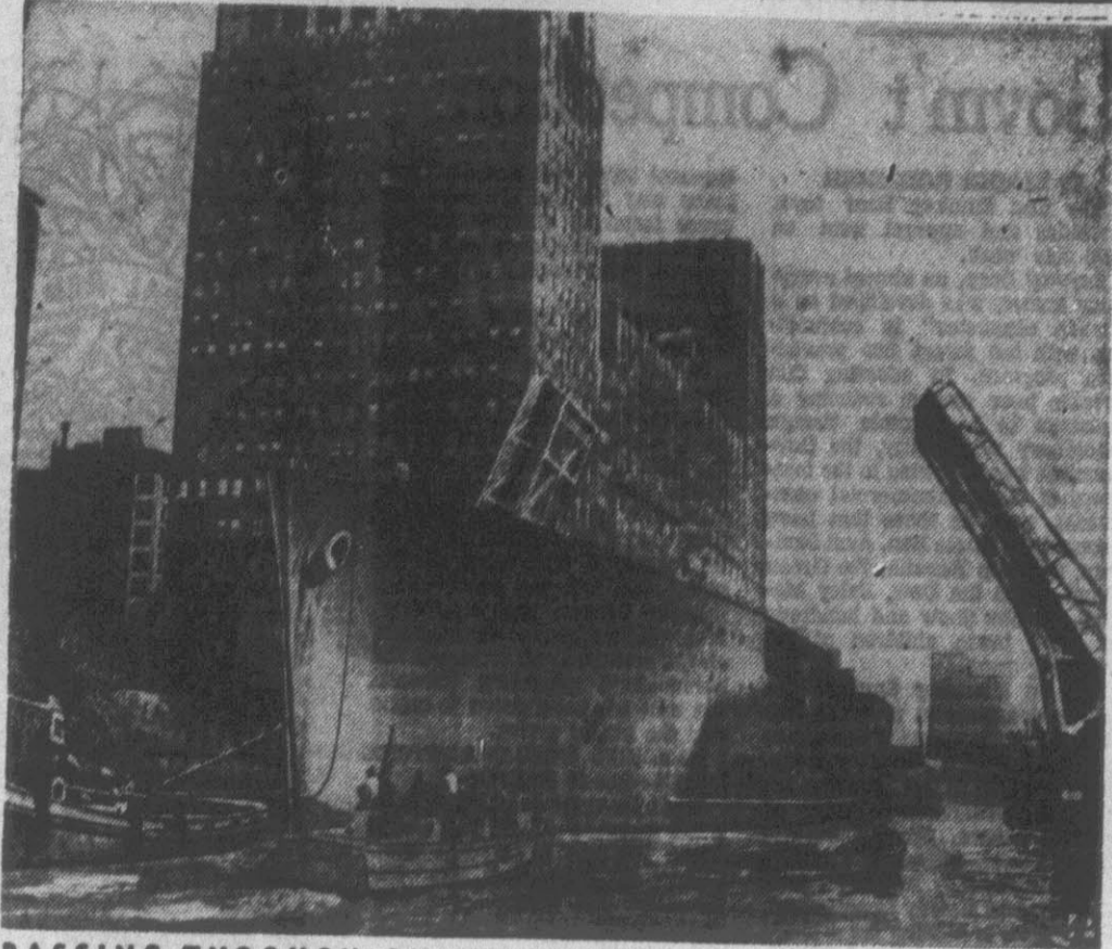
PASSING THROUGH CHICAGO —Marine Star, at 55½ feet the tallest ship to navigate Illinois waterways, passes Washington St. bridge. Pontoon astern reduce ship's draft.