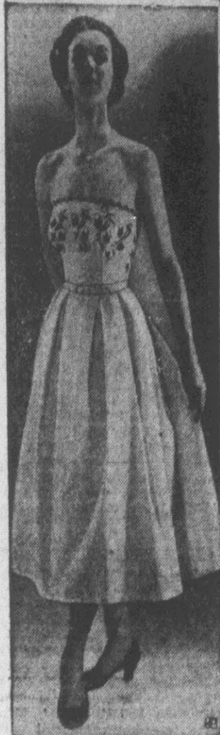
ICED COTTON . . . This white pique outfit consists of bathing suit and skirt, embroidered in color, for fun under sun or stars.