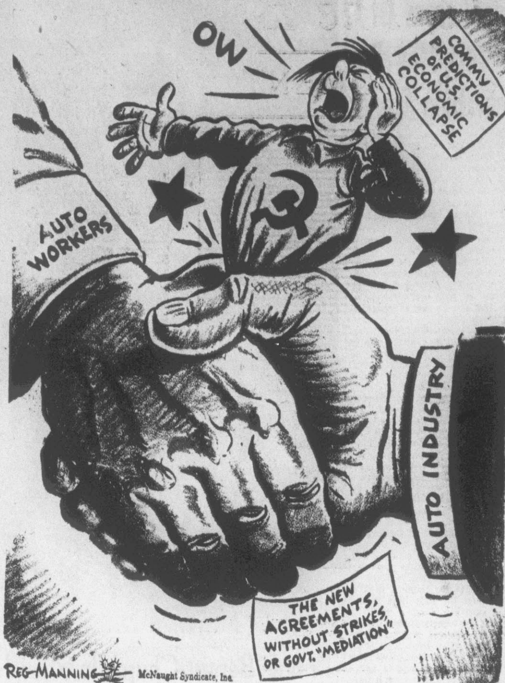
Somebody Told Me . . .