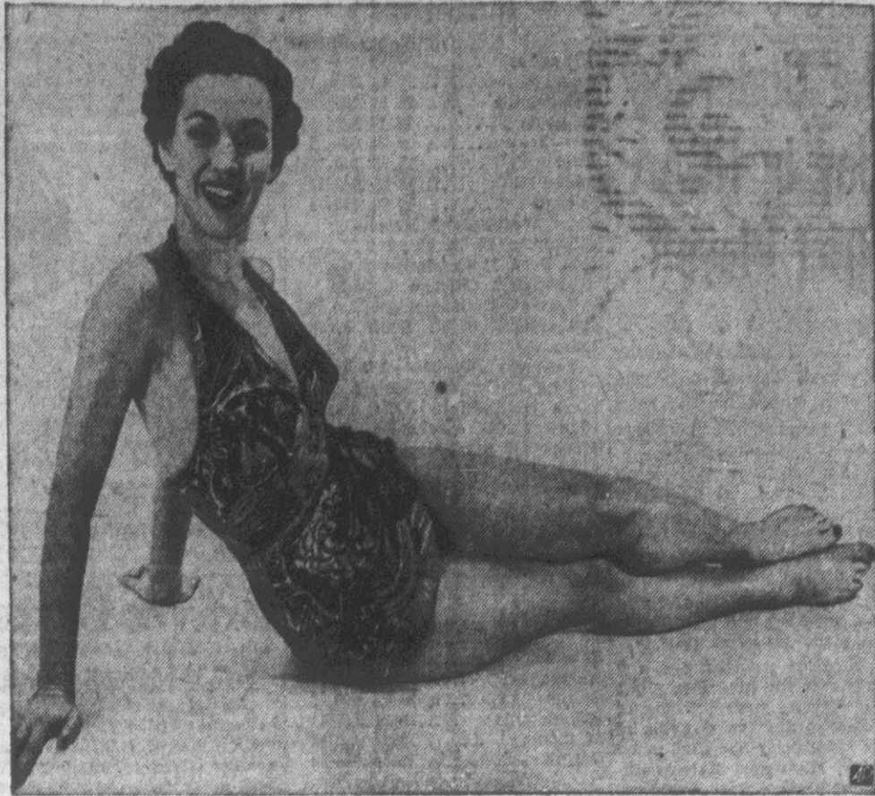
STRIP-TEASE . . . Here is the mood in swim suit ensembles, consisting of the eye-stopping suit at left and the wraparound sarong at right, which may be donned in a jiffy to transform the suit into