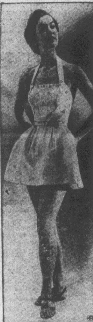
DIAMONDS ARE A GIRL'S BEST FRIEND . . . White pique embroidered in rhinestones makes the strictly sensational bathing suit and matching skirt which provides a girl with an outfit good from dawn to dawn.