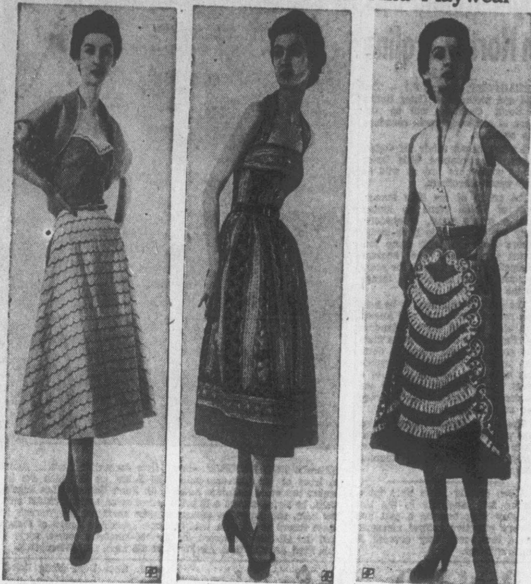
FISH TALE . . . These nautical outfits were designed by Lotte of Drewyn for summer fun, inspired by a new movie, filmed under water. They are (l. to r.): "Breakers," sundress in angelfish blue and white, with marine scallops on the skirt; aquarium print sundress in brown, white and coral; blue denim skirt with white fringe swags and embroidered motifs.