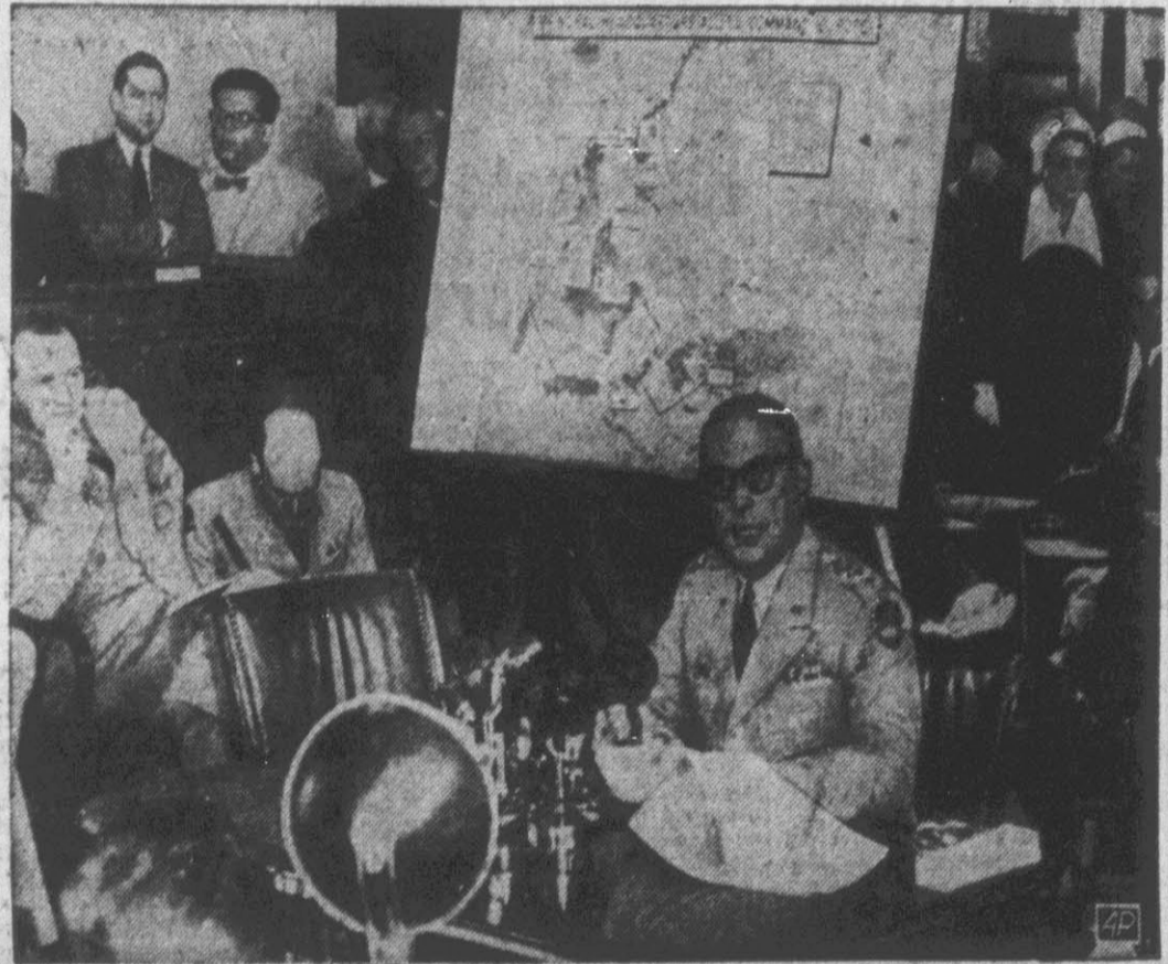
DISCOUNTS RED PEACE OFFENSIVE:—Gen. Matthew Ridgway, European defense commander, tells a House foreign affairs committee in Washington that the Soviet talk of peace has done nothing to lessen the need for strong defenses in Europe. Ridgway spoke in support of the administration's request for more than five billion dollars of continued foreign aid in the 12 months beginning July 1.

Parents are usually a problem when they try to be overly helpful. However, with most children, having one parent around is a source of comfort and security. Both may prove a distraction. If the extra parent can't be shooed away, give him something "important" to do, like holding a light switch, or props away off in the corner.