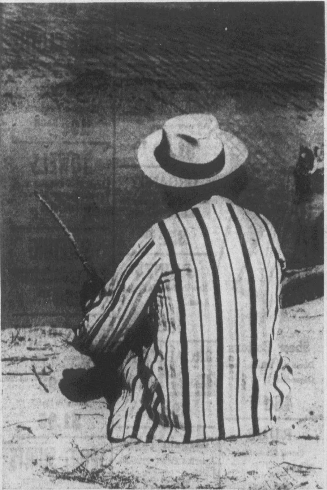
Whether one goes to the river to fish, or to get-away-from-it-all, sitting on the bank of the Tar is one way to find relaxation of the mind and of the body. Even if the fishing is only a half-hearted gesture, there grows a feeling of being at peace with the world.