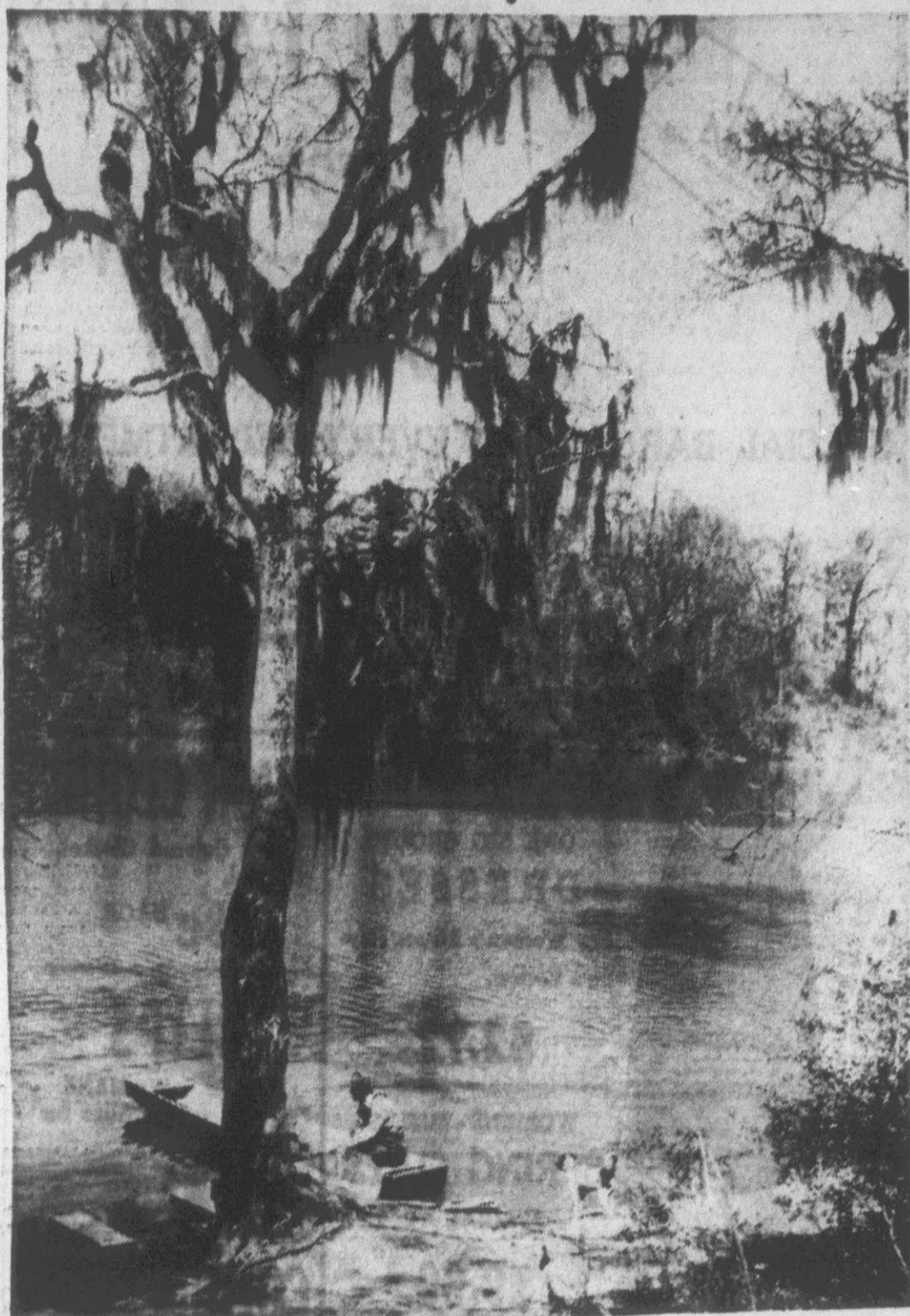
There is beauty on the bend of the river; and just as there are many rivers, there are many scenic spots to delight the heart. Whether standing on the banks, or drifting with the current, there is magic in gazing on "other side" of the most sluggish stream.