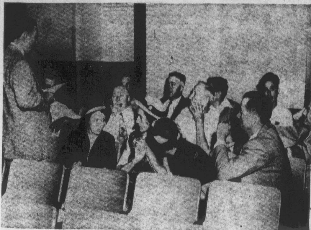
Pitt County Democrats gathered in the court house Saturday noon for their annual caucus in preparation for the state convention. Above, a delegation confers on party matters prior to the county convention.