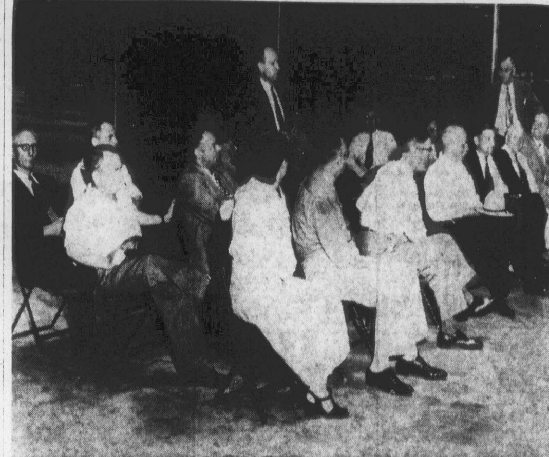
Democrats of the sixth Pitt County precinct (above) met at noon Saturday, as did party members of 22 other precincts over the county. Scattered reports indicated generally fewer in attendance at precinct meetings than the sixth. The principle business of most meetings was the selection of delegates to the county convention next Saturday. (Reflector Photo by Roy Hardee).

Sixth Precinct Democrats Hold A Conclave