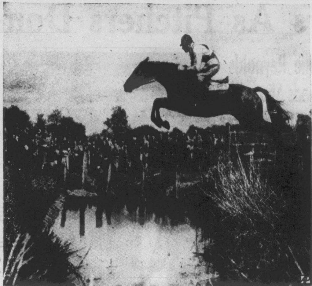
TRYING FOR BRITISH TEAM — Lt. Comdr. R. Oram, R. N., takes Bambi V over water jump in Olympic equestrian trials at Badminton, England, as royally watched with spectators.