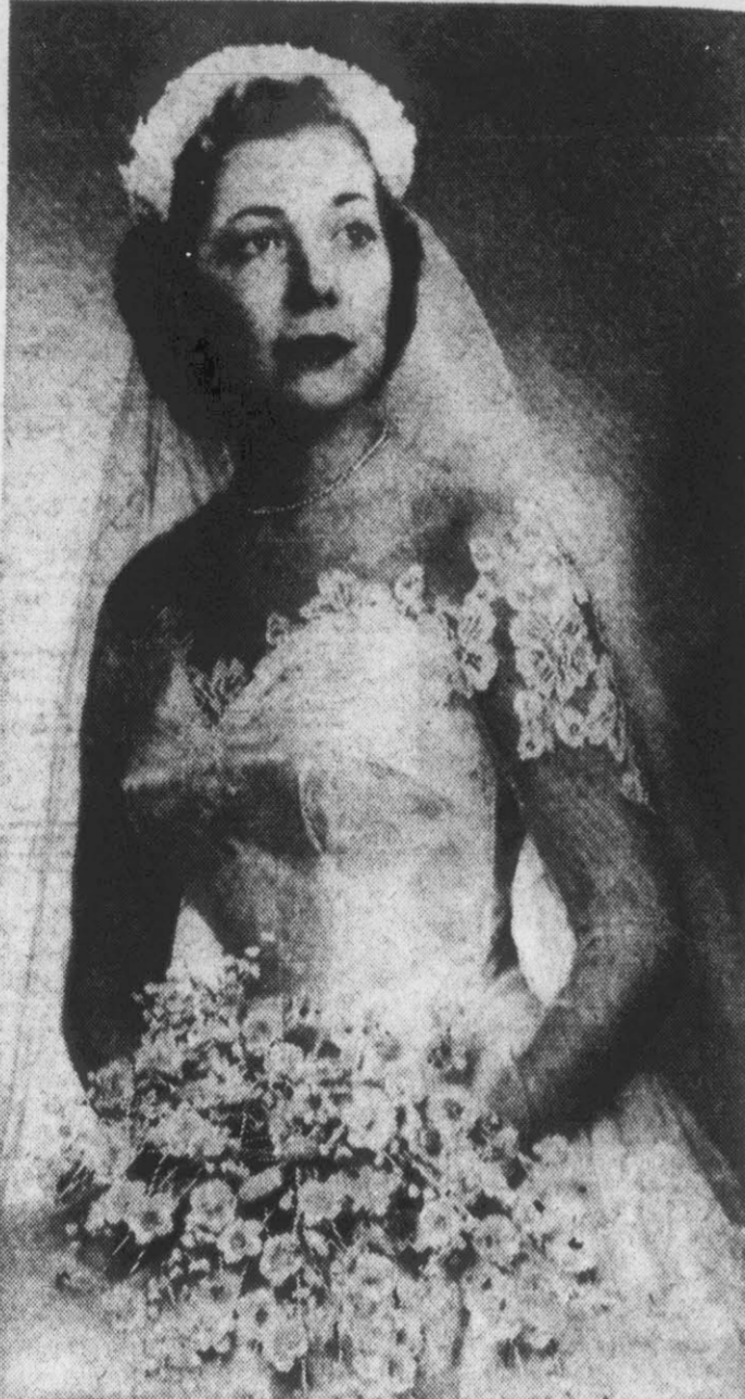
Carried a clustered bouquet of white Cymbidium orchids and valley lilies tied with illusion.

Given in marriage by her father, the bride wore a gown of blue tulle over satin with pure white clipped Chantilly lace applied to the illusion yoke, and pointing into long tulle sleeves. The bouffant skirt, appliqued with cascades of lace, ended in a cathedral train. Her three-tiered veil of blue imported illusion fell from a French plateau bonnet of lace, and her only ornament was a strand of pearls, a gift of the groom. She