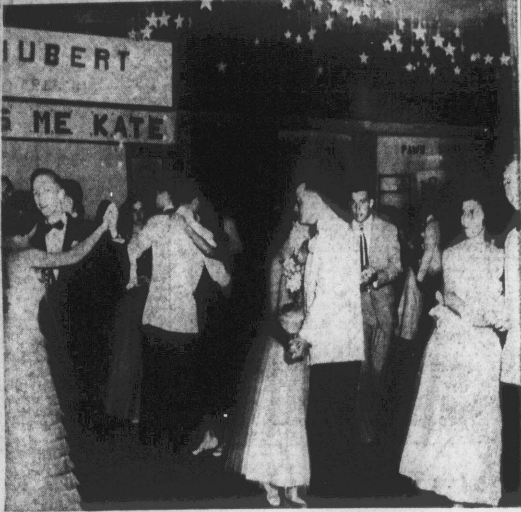
The Junior Class played host to the 1952 graduating class at Greenville High School last night at the annual Junior-Senior dance which featured the Spirit of Broadway. In addition to the class members, a number of townspeople were on hand for the dance and the floor show.

Woman's Club Notice The Woman's Club is having its final meeting of the year on Wednesday night, May 7, at 8:00 o'clock at the club house.