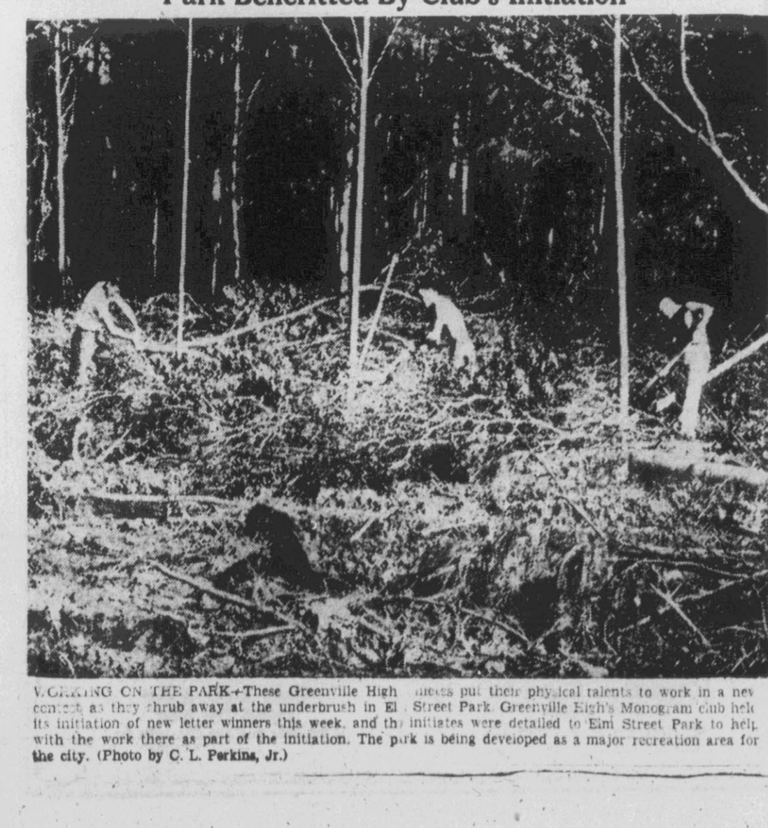
WORKING ON THE PARK—These Greenville High students put their physical talents to work in a new contest as they shrub away at the underbrush in El Street Park. Greenville High's Monogram Club held its initiation of new letter winners this week, and the initiates were detailed to El Street Park to help with the work there as part of the initiation. The park is being developed as a major recreation area for the city.

By ROGER W. BABSON BABSON PARK, Mass. — We read much in the newspapers these days about the need of America to undergo a moral rejuvenation. In this column I have tried repeatedly to give suggestions as to how to bring this about. I have suggested religion, ethics, education, thrift and a closer attention to land ownership as some of the remedies. Today, I shall attempt to go further into the "grass roots" of the problem. Where Do We Belong? About the turn of the century a great sociologist named Charles Horton Cooley coined a new word: "Socius." This man said that you could look at any man from two points of view: (1) As a member of his social group; or (2) you can look at any man as an individual apart from his group, or as a rugged individualist. It is the latter that we want politicians and labor leaders want all men to be. If they can submerge individuality, they will then be able to achieve their goals. This explains why the Russians are working so hard to develop collective farms. The independent farmer thinks too much as an individual, to fit into the Russian purposes. This also applies to Chinese farmers who own their farms, but not to "renters." Let's Look At History In the "horse-and-buggy" era of our history the rugged individual rarely, if ever, let his own private convictions be submerged by the group judgment of a committee, board of directors, or political par-