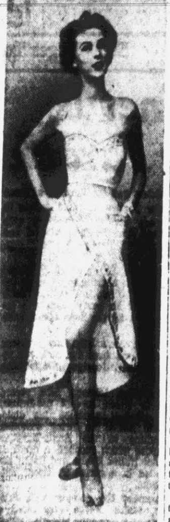
GOLDEN TOUCH ... Beach ensemble in embossed cotton bathes with gold trim, by Margaret Newman.

By DOROTHY ROE Associated Press Fashion Editor The girl who is planning a winter vacation can assemble an all-cotton wardrobe this year, ranging all the way from beach and play clothes to travel ensembles. So many and varied are the new cotton fabrics that there is one for practically every purpose and taste. Beach and evening clothes, for instance, are being made in textured cotton satin, matelasse pique, cotton taffeta, and metallic cottons. "Dressed-up" denim and terrycloth appear in some of the newest town and travel outfits, while woven plaid chambray and new weaves of pique are used for some of the smartest sun fashions. Charcoal gray terry cloth and pique dyed to match make one of the season's most unusual beach ensembles—the swim suit in pique, the sweater-jacket in terry. Bright coral and matching striped denim is used in a new group of separates. For travel, cotton tweed is a new favorite, showing up in both suits and dresses which take to the road with the greatest of ease. One designer shows rain ensembles, consisting of raincoat, skirts and umbrella in satin-striped cotton. Lacy-knit cotton sweaters top the outfits. And of course, for formal wear there are the glamorous cotton and voile to a new cotton chiffon. The cotton resort wardrobe is the choice of smart travelers, who know "at in warm climates, King Cotton still reigns."