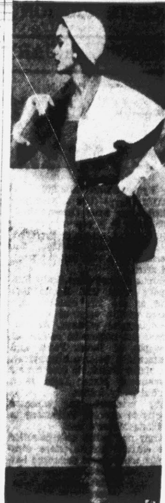
GOOD TRAVELER ... Sheath dress and reversible cape in gray textured cotton tweed and white pique.

By DOROTHY ROE Associated Press Fashion Editor The girl who is planning a winter vacation can assemble an all-cotton wardrobe this year, ranging all the way from beach and play clothes to travel ensembles. So many and varied are the new cotton fabrics that there is one for practically every purpose and taste. Beach and evening clothes, for instance, are being made in textured cotton satin, matelasse pique, cotton taffeta, and metallic cottons. "Dressed-up" denim and terrycloth appear in some of the newest town and travel outfits, while woven plaid chambray and new weaves of pique are used for some of the smartest sun fashions. Charcoal gray terry cloth and pique dyed to match make one of the season's most unusual beach ensembles—the swim suit in pique, the sweater-jacket in terry. Bright coral and matching striped denim is used in a new group of separates. For travel, cotton tweed is a new favorite, showing up in both suits and dresses which take to the road with the greatest of ease. One designer shows rain ensembles, consisting of raincoat, skirts and umbrella in satin-striped cotton. Lacy-knit cotton sweaters top the outfits. And of course, for formal wear there are the glamorous cotton and voile to a new cotton chiffon. The cotton resort wardrobe is the choice of smart travelers, who know "at in warm climates, King Cotton still reigns."