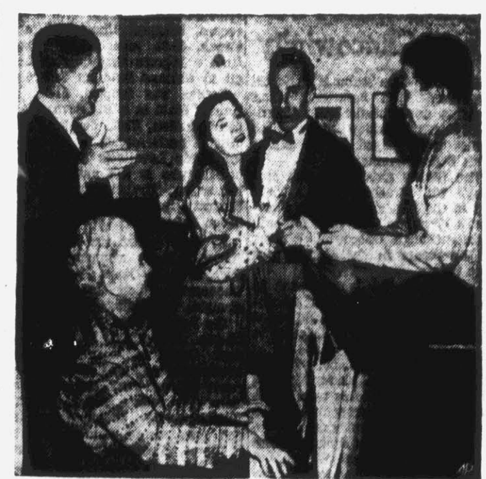
REHEARSAL in the Grass Roots opera school.