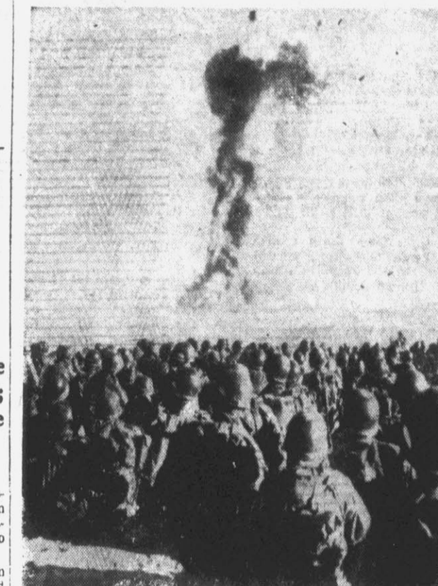
Members of the 11th Airborne Division from Camp Campbell, Ky., kneel and watch an atomic explosion after withdrawing from prepared positions. The Army and AEC are conducting a joint atomic troop exercise at the Frenchman's Flat test base near Las Vegas, Nev. This was the first time troops had participated in an atomic explosion.