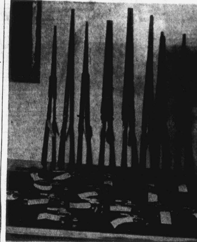
This is the cache of rifles and pistols—enough to fortify the courthouse where they have been housed—that were sold at public auction this afternoon. The rifle second from left is a murder weapon which was confiscated by the court. The defendant has long since gone to jail.