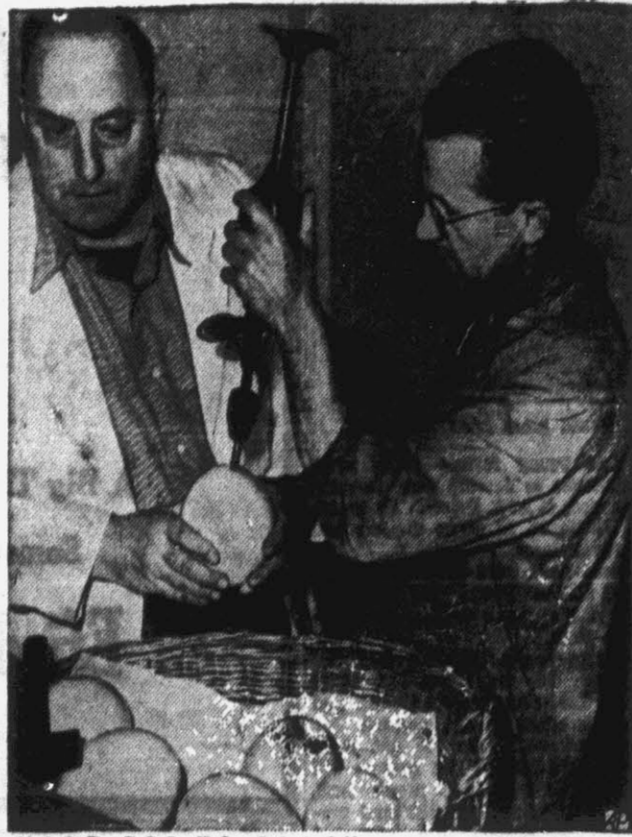
HARD EGG TO CRACK —Employees in the Frankfurt, Germany, Zoo drill a hole in an ostrich egg to extract its contents for an omelet, part of a special dinner at the Zoo.

almost completely within limits of the sprawling Navajo Indian reservation. In the past it has been considered a colorful arid wasteland, cut by sharp defiles and treacherous canyons, many of them never explored by white men. But today it holds the country's hopes for more and more of the dangerous stuff that has helped mold foreign policies and remake the world's alignment of power. The four corners deposits are both a blessing and an enigma. Charles H. Dunning, veteran Arizona mining figure and for seven years director of the Arizona department of mineral resources, says there is every indication the present mines operating in the