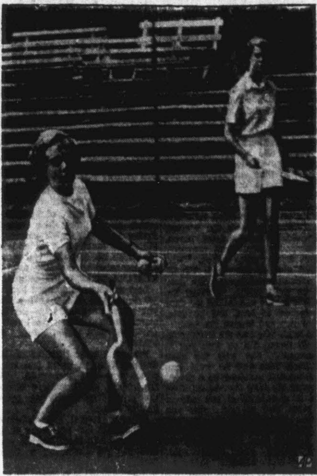
ROYAL COURT PLAY — Princesses Birgitta (left) and Margaretha of Sweden, granddaughters of late King Gustav V, a tennis enthusiast, learn the fundamentals of his favorite game.

Rainfall records were not kept in Europe until the middle 1800s.