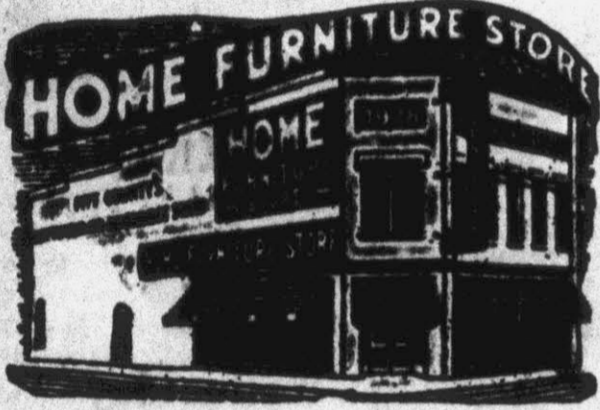
Corner Dickinson Ave. & 8th St. — Dial 2879

At New Carolina Warehouse Dickinson Ave.