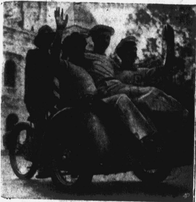
SPEED THRILL—This motorized rickshaw was built for one but three French sailors in Saigon crowd aboard.

By KENNETH LIKES SAIGON (AP)—A new menace looms in the Far East—the motor rickshaw. Some time ago the ancient type of rickshaw, pulled by a runner, gave way to three-wheel, medium-speed vehicles pedaled like bicycles and usually called pedicabs or trishaws.