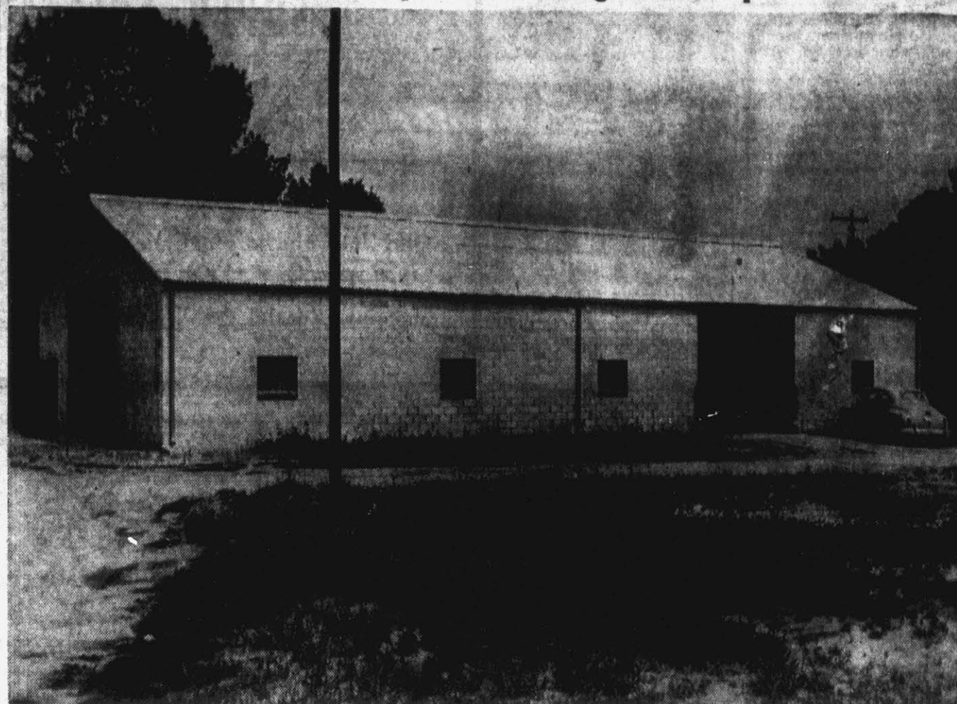
Shown above is the newly completed State Highway Patrol garage located at the intersection of Fifth street and the 10th Street highway extension. The structure, 62x32 feet, is modernly equipped in every way to repair the automobiles operated by Patrol Troop "A" which covers the Eastern section of North Carolina. (Reflector Staff Photo by Roy Hardee).