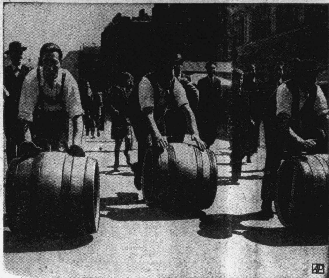
ROLLING OUT THE BARRELS—Followed by townsfolk, Bavarian brewery workers roll their product in beer barrel race over 110-yard Munich course. Man in center won.