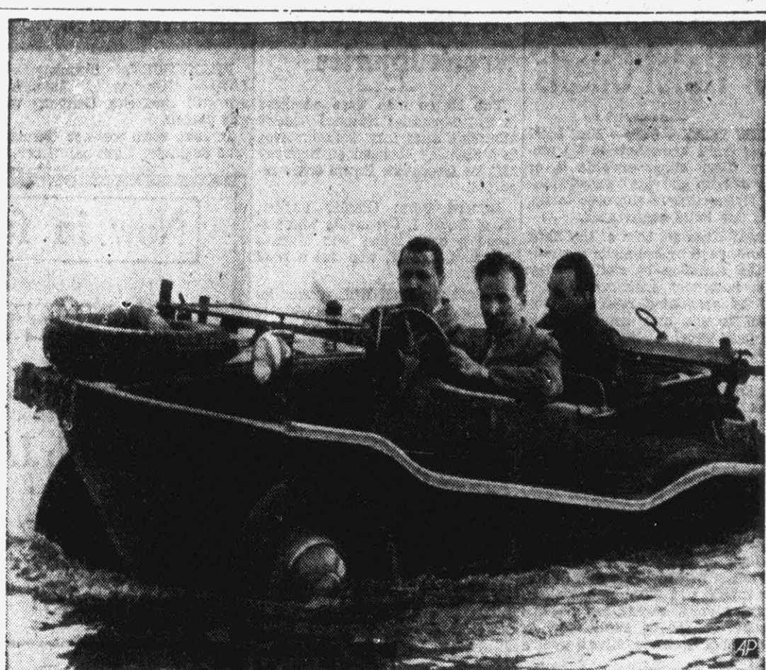
CONVERTED TO PEACETIME PLEASURE — An amphibious German Volkswagen, originally intended for war use, is tested on Lake Zurich, Switzerland, as a pleasure craft.