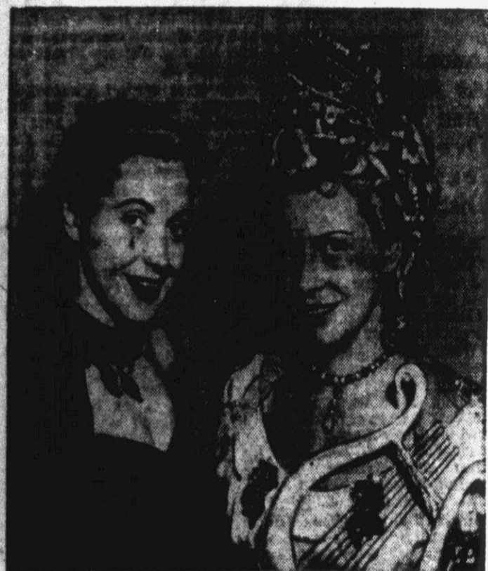
TIME DIFFERENCE —The contrast between a simple 1951 hairdo (left) and elaborate coiffure of the period around 1890 is demonstrated at German hairdressers contest in Cologne.