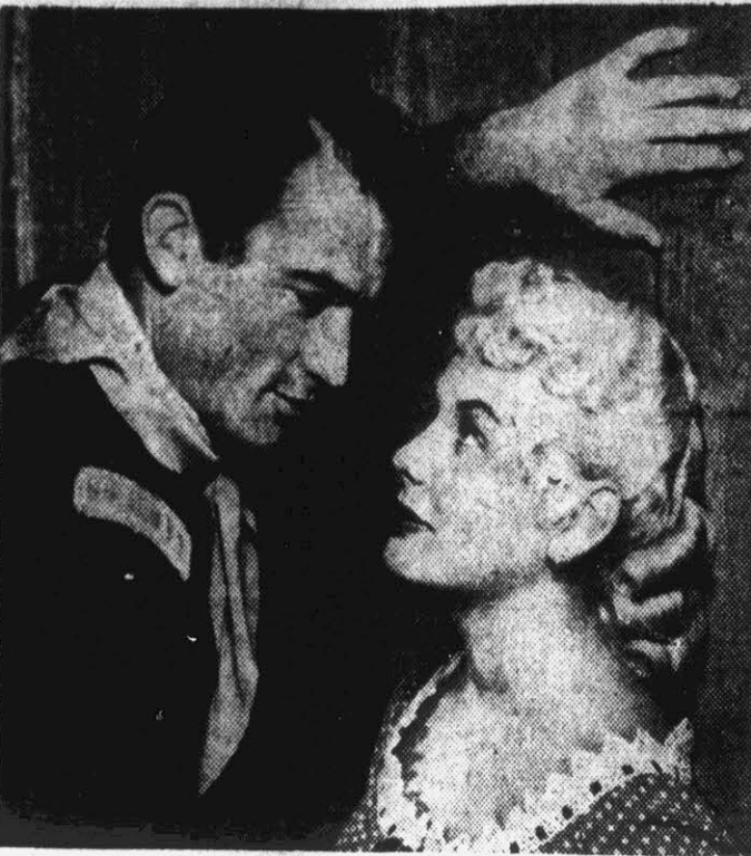
Gregory Peck and Barbara Peyton head the cast of the dramatic adventure story, "Only The Valiant."