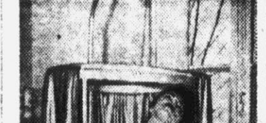
HAUSFRAU'S BOON —This portable German shower demonstrated in Munich is operated by foot pedals which pump used water steadily from the foot tub to the shower spray.