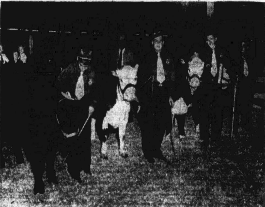
STEAK AND MORE STEAK... Plenty of good eating was for sale at this week's Fat Stock Show, the first to be held in Pitt County, and quite a few pounds of it are shown on the hoof in the above photo.