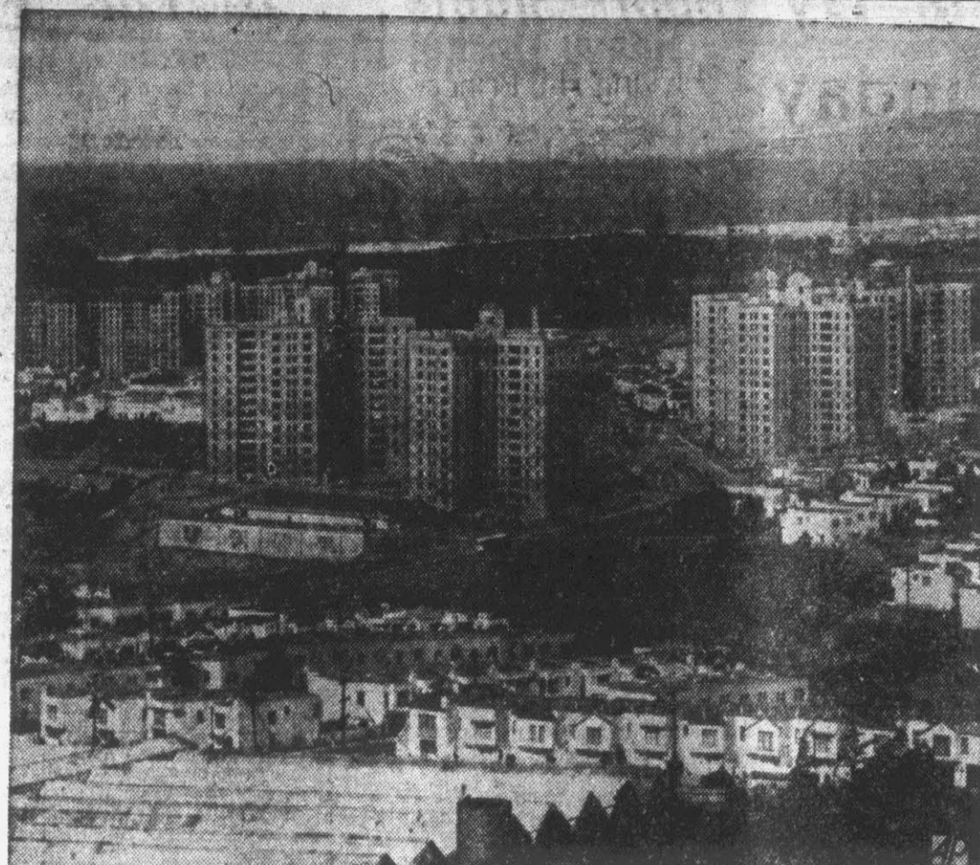
RESHAPING A LANDSCAPE —Eleven separate 13-story buildings being constructed in southwest San Francisco at a cost of $30,000,000 will house more than 5,000 persons.