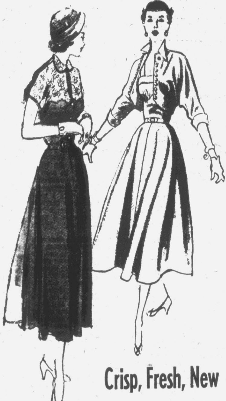
Crisp, Fresh, New Embossed Cotton ONLY 8.90