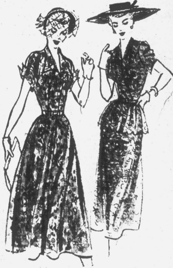
RAYON BEMBERG Sheers Are Amazing Finds at Penney's Special low. 4.98

Frosted With White Embroidery Priced At A Cool Little