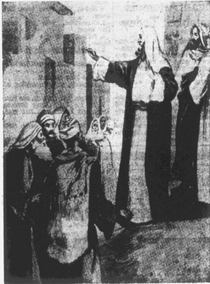
The apostles preaching in Jerusalem.

"Repent ye and be baptized every one of you in the name of Jesus Christ unto the remission of your sins; and ye shall receive the gift of the Holy Spirit."—Acts 2:28.