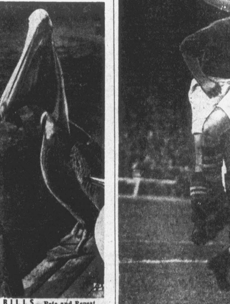
PRESENTING THEIR BILLS—Pete and Repeat, a pair of Florida brown pelicans, cross bills in either affection or temper at their home in Marine Studios, Marineland, Fla.

James Bruce (above), former Ambassador to Argentina, was nominated by President Truman to head the $1,314,010,000 foreign military assistance program. James Bruce (above), former Ambassador to Argentina, was nominated by President Truman to head the $1,314,010,000 foreign military assistance program.