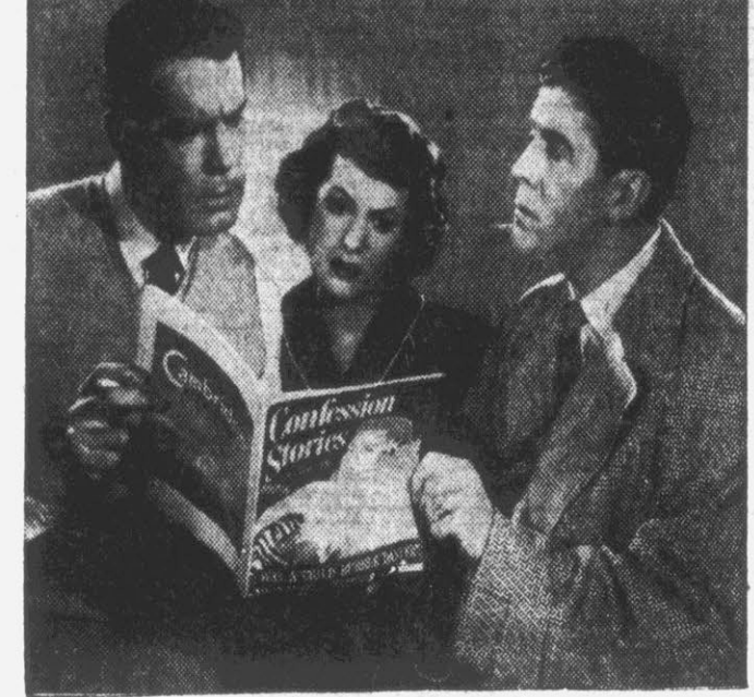
"Father Was a Fullback," opening Sunday at the Pitt, brings you a line-up of laughter. It stars Fred MacMurray, Maureen O'Hara and Rudy Vallee above along with Betty Lynn and others.