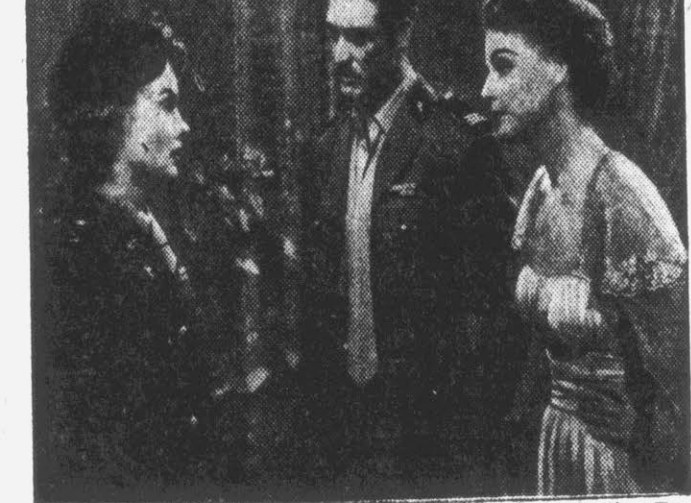
"I Was a Male Warbride" comes to the Pitt three days starting Tuesday. Marion Marshall is bearer of bad news for Cary and Ann in the above scene from the hilarious comedy.