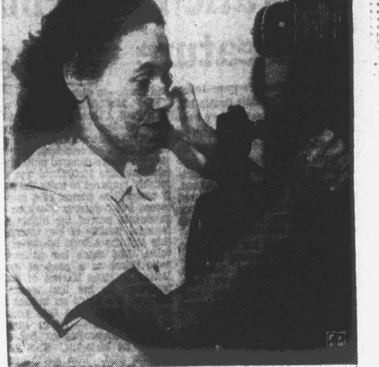
Mrs. Eugenie Anderson receives congratulations over her old-fashioned rura telephone at her farm home near Red Wing, Minn., after President Truman nominated her for U. S. ambassador to Denmark. She is a Democratic national committeewoman from Minnesota. If her nomination is confirmed, Mrs. Anderson will be the first woman to hold the rank of ambassador in the diplomatic service.

now 720,000 tons a year, which is less than one per cent of annual steel tonnage.