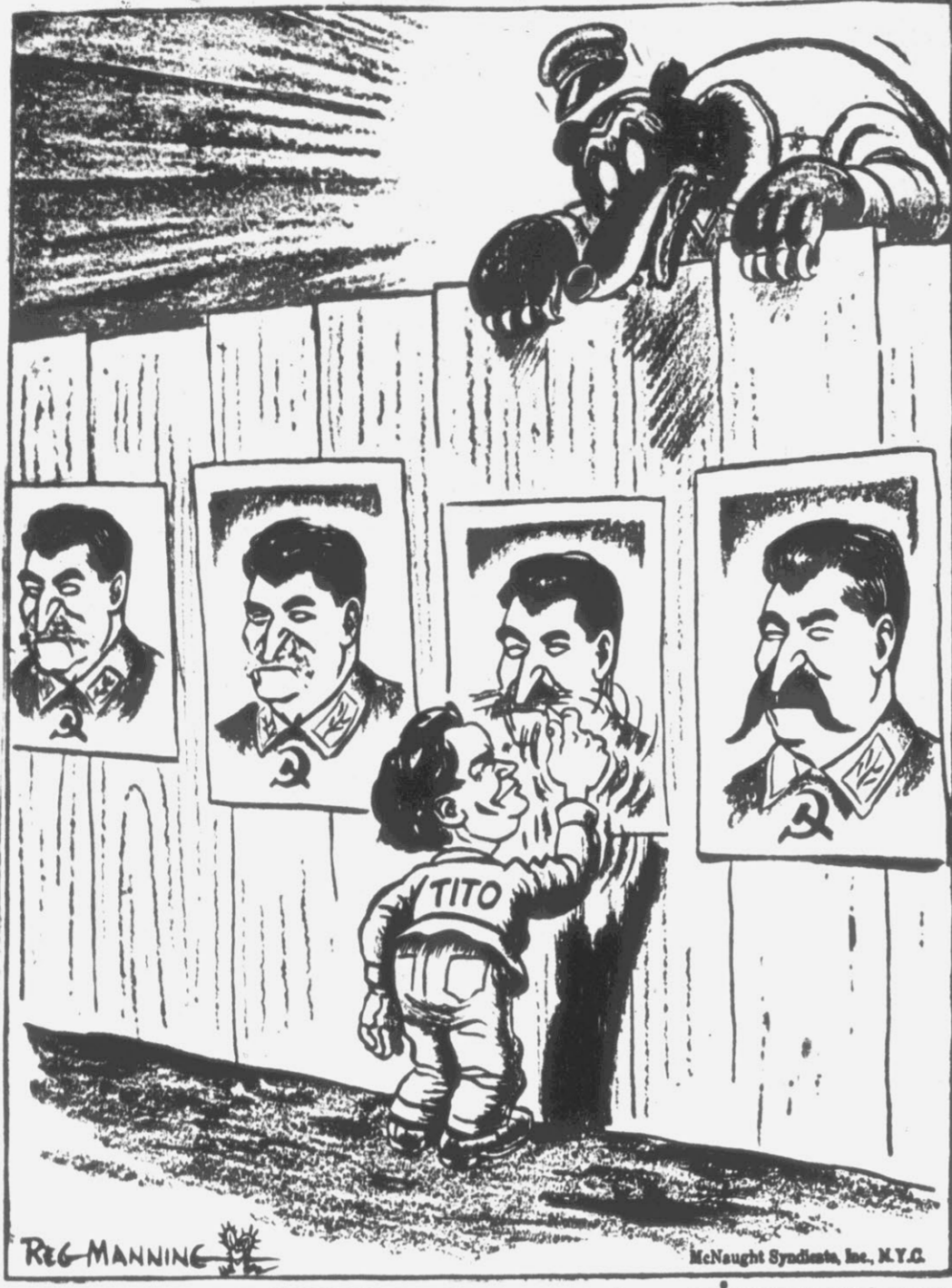
McNaught Syndicate, Inc., N.Y.C.