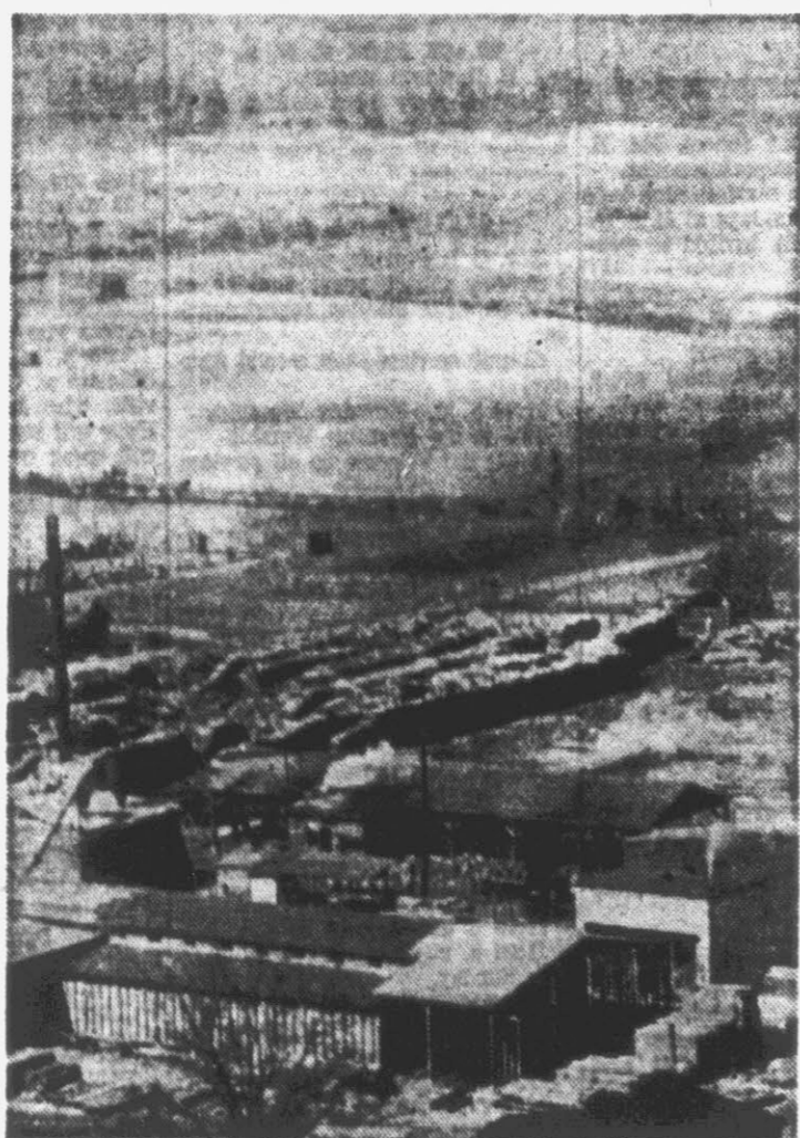
REBUILT LUMBER PLANT SAW MILL — DRY KILN — PLANING MILL

43 Years Experience Lumber Manufacturing Building Material Dealer