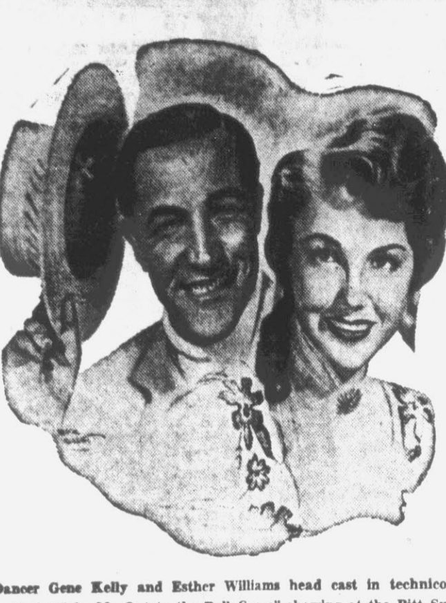
Dancer Gene Kelly and Esther Williams head cast in technicolor musical, "Take Me Out to the Ball Game" showing at the Pitt Sunday and Monday.