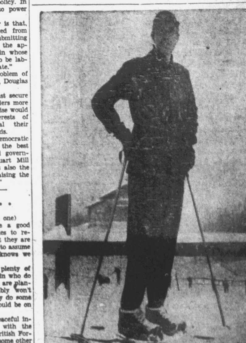
DIPLOMATIC SKIER—W. Averell Harriman, United States Special Representative in Europe for the Economic Cooperation Administration, takes to skis at Arosa, Switzerland.