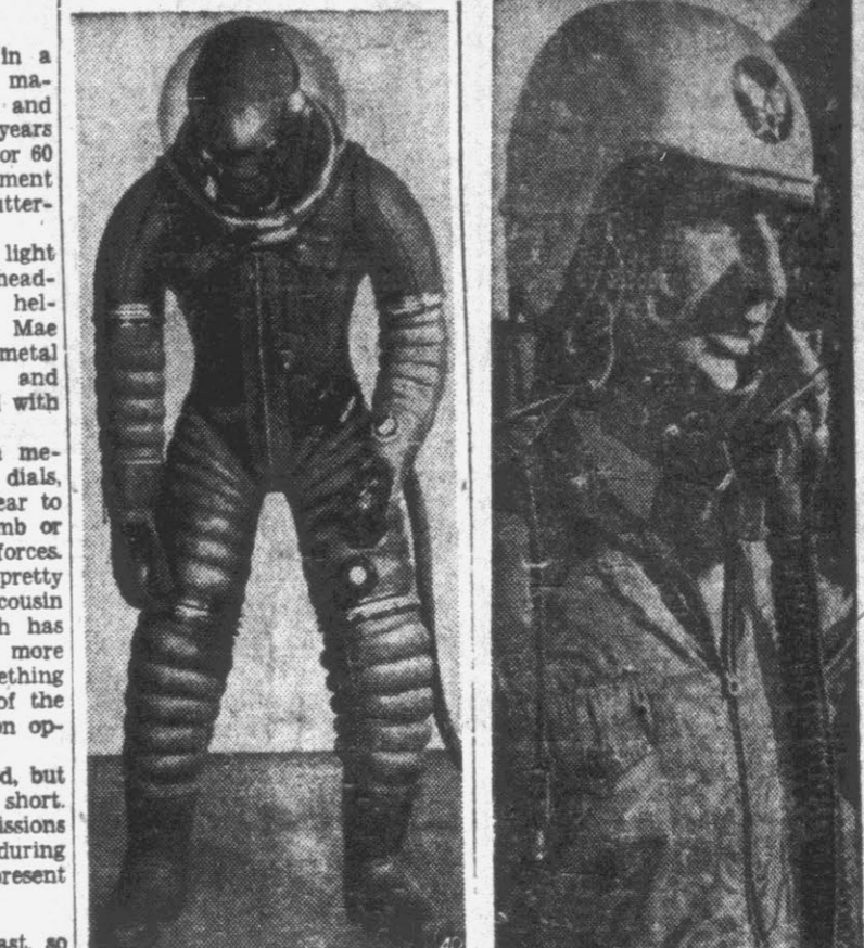
MAN FROM MARS? No. It's an Army Airman in a pressurized suit for high flying.

an emergency exit are being developed. In one the seat is shot out on rails pointed upward and rearward after the canopy is blown off. In the other the entire cockpit is built as a capsule which can be detached to fall free. The pilot leaves the capsule a safe distance from the ground.