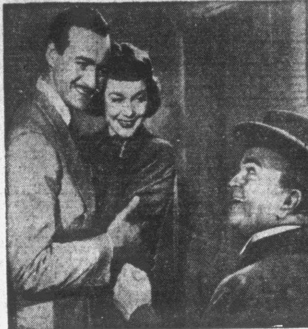
Jane Belinda Wyman, David Niven and Victor Moore come to the Pitt Sunday in sprightly romance, "Kiss In The Dark."