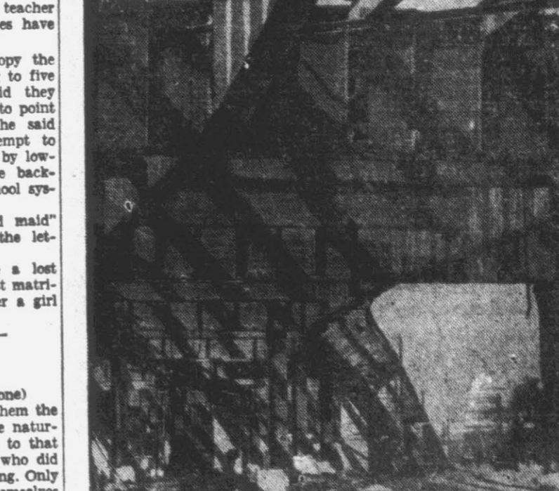
STEEL FRAME—The Capitol at Washington stands framed by the steelwork for the new South Capitol building which will span the Anacostia River in November.

spread of Communism had been abandoned. But it would believe sons of the Stalin in a Europe still suffering grievously from effects of the late world conflict.