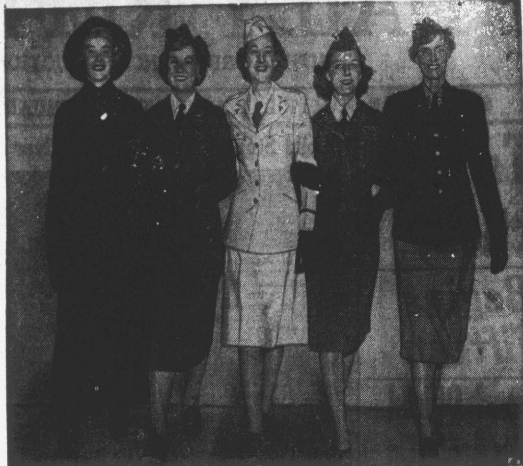
ARMY NURSES THROUGH THE YEARS —Uniforms worn by the U. S. Army Nurse Corps are shown at the Corps' Anniversary celebration at Walter Reed Hospital, Washington. Left to right: 1917-1920; 1920-1930; 1930-1942; 1942-1945; summer beige; 1942-1945; flight nurse; 1946 to present.