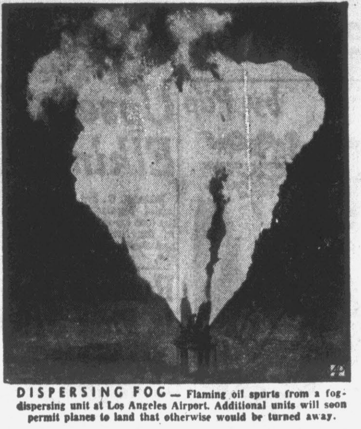
DISPERSING FOG —Flaming oil spurts from a fog-dispersing unit at Los Angeles Airport. Additional units will soon permit planes to land that otherwise would be turned away.