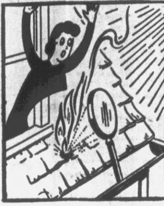
A reading glass slipped from a window sill, lodged in a caverstrough and focused the sun's rays on dried shingles. Result: $10,000 in damage. Fish bowls and bottle cause similar fires.

are dying every day in fires that attack homes every minute-and-a-half," the association finds out. Matches not kept out of the reach of children, careless smokers, dry cleaning at home, furnaces in need of repair are among causes of 90 per cent of all fires, the association reports. Here are some examples.