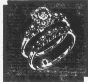
MALDEN Ring 675.00 Also $575 Wedding Ring 150.00