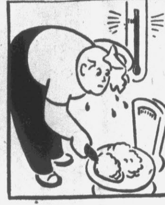
A man perspired while weighing sodium peroxide. A few drops of sweat fell on the explosive chemical used in bleaching textiles. The dye-house, guarded against moisture, went up in flames.