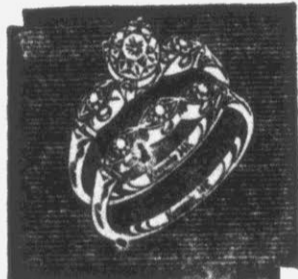
JONQUIL Ring 125.00 Wedding Ring 62.50