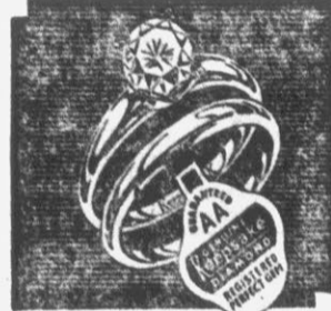
HEATHER Ring 350.00 Also $100 to 2475 and in platinum $300 to 3450 Wedding Ring 12.50