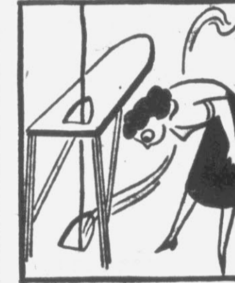
An electric iron was left connected and resting flat on an ironing board, while a housewife talked with a neighbor. When she returned, the iron had burned through ironing board and floor.