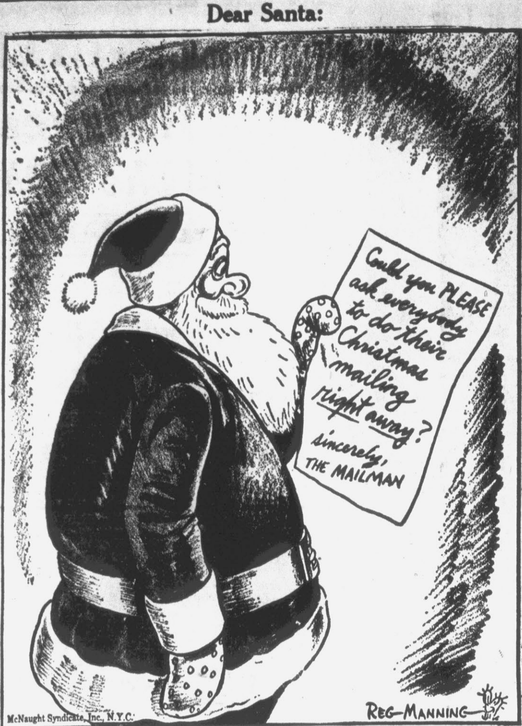
McNaught Syndicate, Inc., N.Y.C.

A farmer died, leaving several hundred acres of land and two sons. One of the boys bought the interest of the other for $5,000, which left him with investment of $10,000 in the farm.