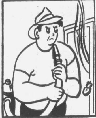
A lit pipe in the pocket of a coat in a wooden locker started a fire. Workers tried in vain to open a left-handed fire hydrant. By the time they sounded the alarm, the fire caused $35,000 in damage.