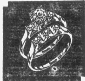
LOWELL Ring 200.00 Also $350 Wedding Ring 100.00