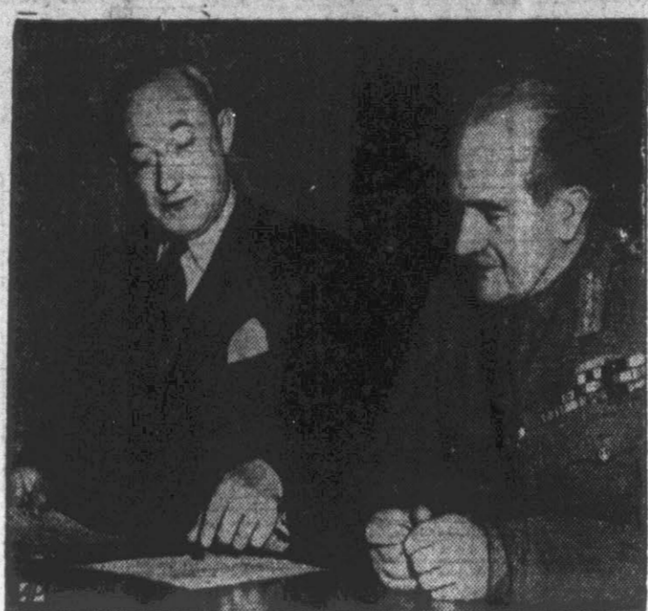
BRITONS CONFER — Emanuel Shinwell (left), British Secretary of State for War, confers with Gen. Sir William Slim, new chief of the Imperial General Staff, in London.