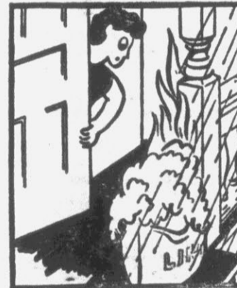
Water starts fires sometimes. Workmen left unslaked lime on the porch of a two-story home. A sudden shower soaked the lime, which boiled over, set fire to the woodwork, damaged the house.