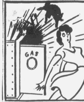
Static electricity can cause sparks that set fires. These sparks are visible in the dark when rubbing a cat's fur the wrong way. When a cat was put in a gas chamber the lethal gas exploded.