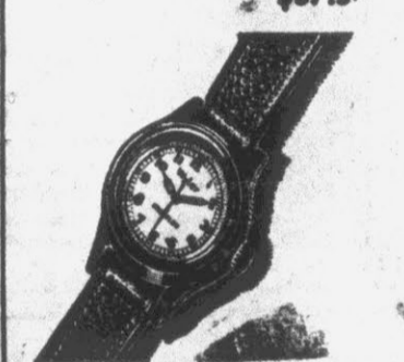
Ladies' watch in stainless steel. Sweep. 17 Jewels. $59.50.