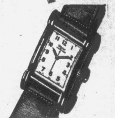
Man's watch in stainless steel. Sweep or non-sweep. 17 Jewels. Non-Sweep, from $65.00. With Sweep, from $67.50