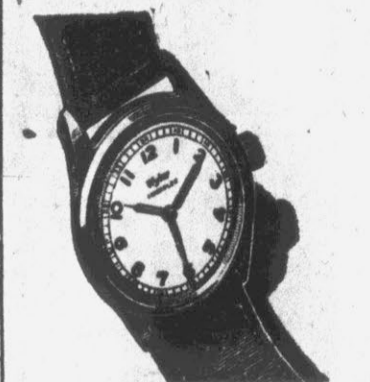
Man's watch in chrome with stainless steel back. Sweep. 17 Jewels. $39.75 and up. Same in stainless steel. $57.50

Incaflex balance wheel, which absorbs all shocks, assuring remarkable accuracy. Wyler will replace, free of charge, any balance staff, balance wheel or balance jewels if damaged or broken.