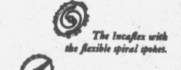
The Incaflex with the flexible spiral spring. A conventional balance wheel.

Also many styles in ladies' fancy dress, both yellow and white. . . . Yes, they all have the new patented unaflex balance wheel, which is guaranteed never to break.