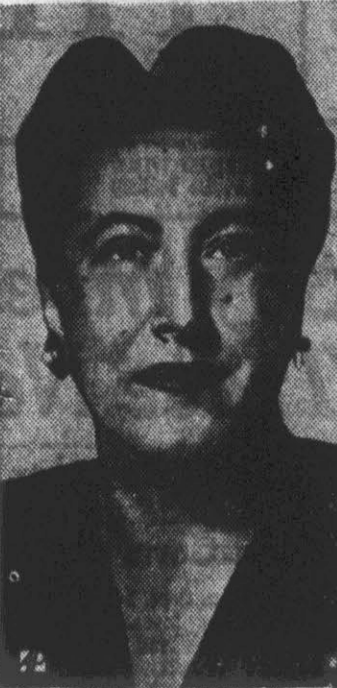
SINGER—Helen Traubel, Wagnerian soprano, is observing her tenth year as a concert singer. She's from St. Louis.