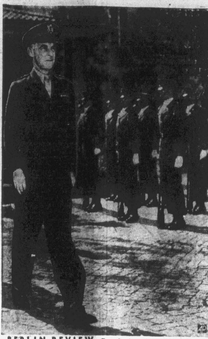
BERLIN REVIEW—Gen. Lucius Clay, U. S. military governor in Germany, reviews Berlin headquarters guard.