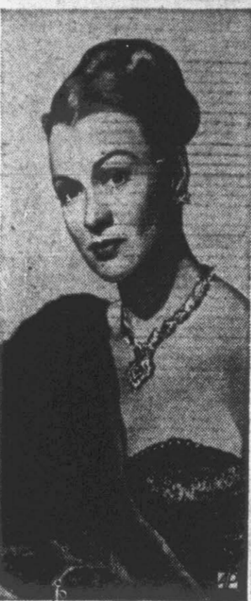
ACTRESS—Eve Arden of the films wears a casually draped mink stole over her strapless lace evening gown.