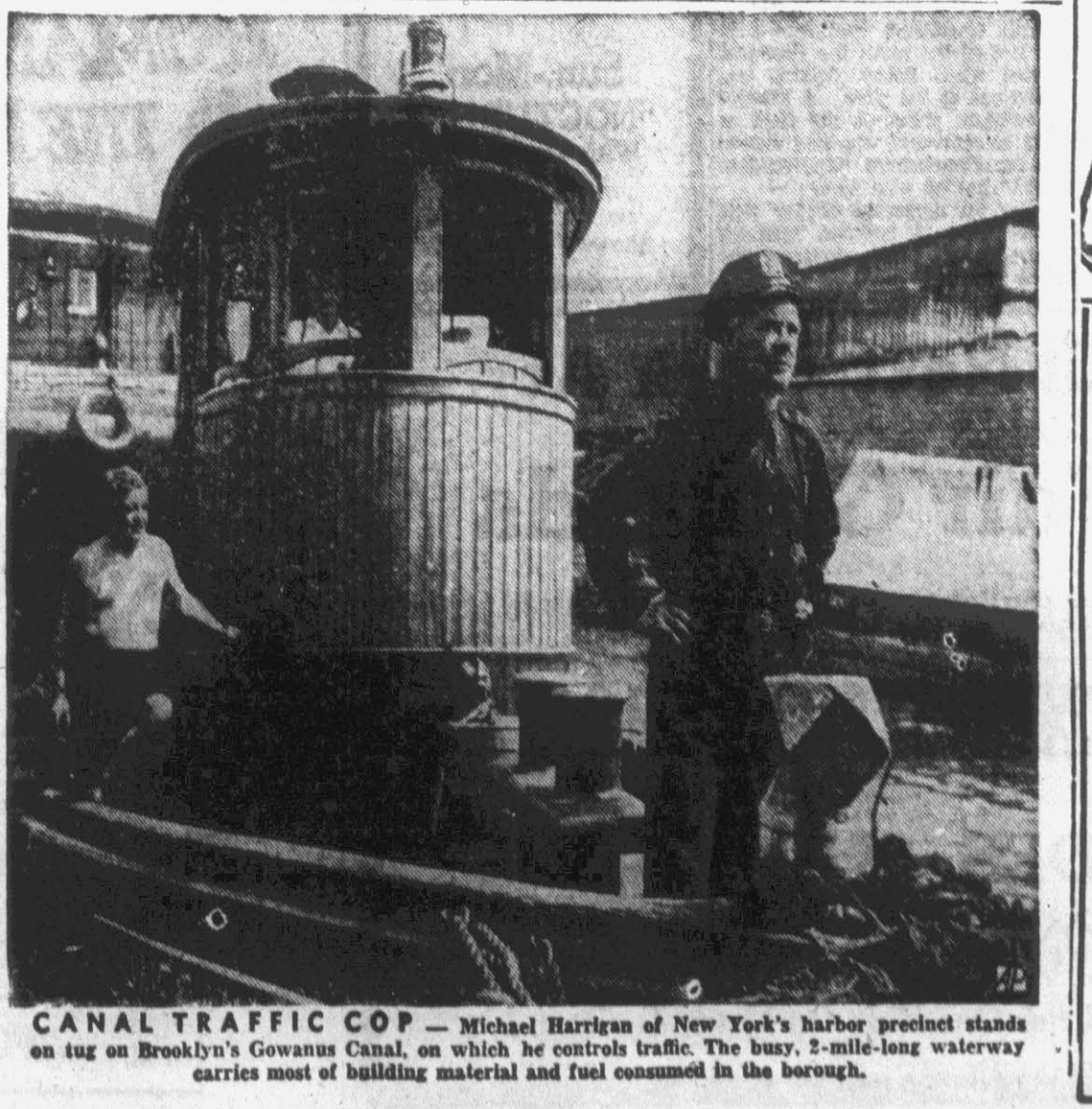
CANAL TRAFFIC COP—Michael Harrigan of New York's harbor precinct stands on tug on Brooklyn's Gowanus Canal, on which he controls traffic. The busy, 2-mile-long waterway carries most of building material and fuel consumed in the borough.