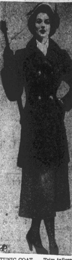
TUNIC COAT . . . Trim tailored style in black Persian lamb, with half belt in back. By Fredrica.

MERCHANT DIES Dunn, 73.—(AP)—Benjamin Fleishman, 73, who started as a pack peddler before the turn of the century and built up a dollar store chain in the Carolinas, died yesterday.