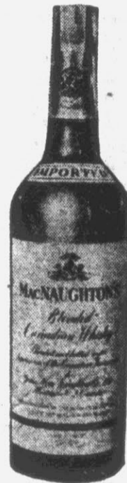
Blended Canadian Whisky, 66.8 proof. Schenley Import Corp., New York, N. Y.