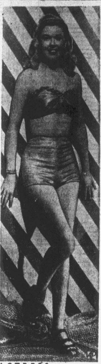
ACTRESS—Doris Day of the films wears a two-piece suit of latex fabric interwoven with silver thread.

Australia's wool industry began in 1938 when 30 sheep arrived from Calcutta, and a few English sheep were brought from Ireland.