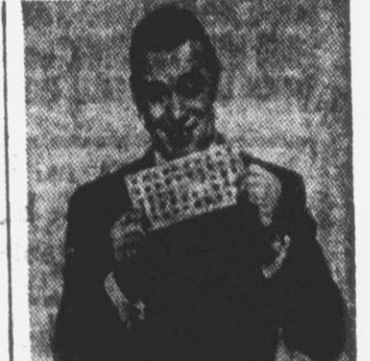
Every entry gets a certificate for the Family Sweepstakes. Cola bottle top. Collect 'em—swap 'em—get a complete set.

Right! Every entry* you send in wins you points for the sensational Family Sweepstakes Prizes! First Prize—$25,000 Cash! So enter often—get your whole family started! 51 Cash Prizes each month in your state—PLUS big Monthly National Prizes! Total cash to be awarded—$203,725!